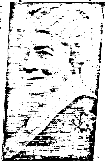
Ruth Bryan Owen Rohde