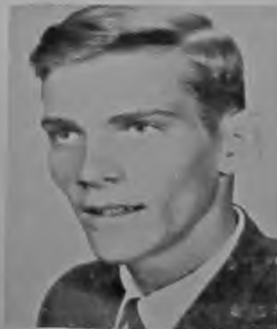
Gives Something Special