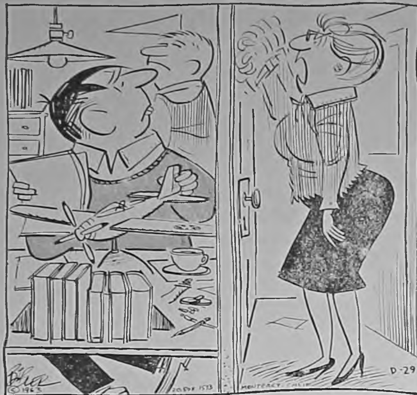
"YOU MAY AS WELL OPEN UP - I OVERHEARD ONE OF THE BOYS DOWNSTAIRS SAY YOU HAD A 'FAULFUL MODEL UP IN YOUR ROOM!'"