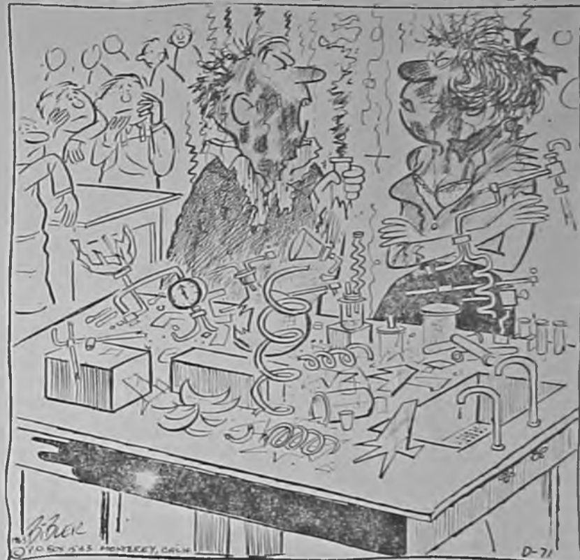
"I SUPPOSE YOU'D RATHER I GOT A DIFFERENT LAB PARTNER?"