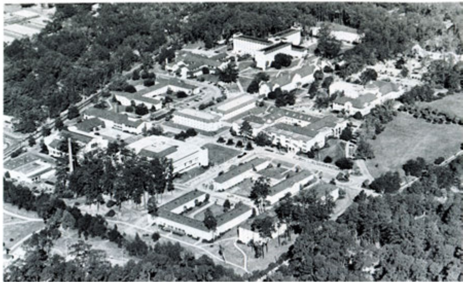
AERIAL VIEW OF MAIN CAMPUS – Valdosta State's main campus, located about 10 blocks from downtown, is beautiful Spanish Mission architecture.