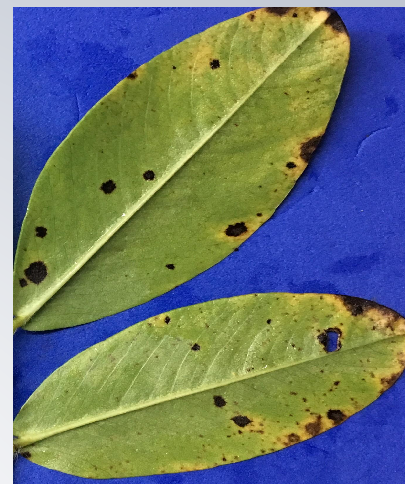
Figure 1. Late Leaf Spot of Peanut

The purpose of this experiment was to test the hypothesis that poor germination from vacuumed collected spores is due to the dissolved pill capsule having a toxic effect on the spores.