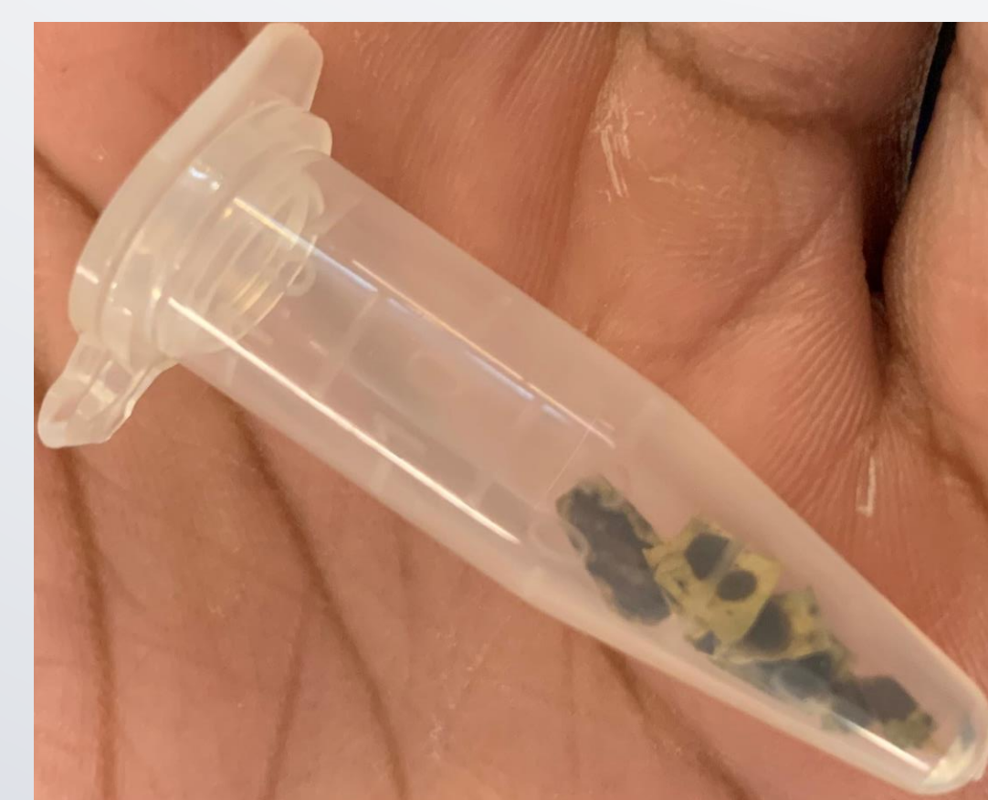
Figure 2C. Dried, sporulating leaf spots placed in a non-dissolvable microfuge tube when preparing solution.