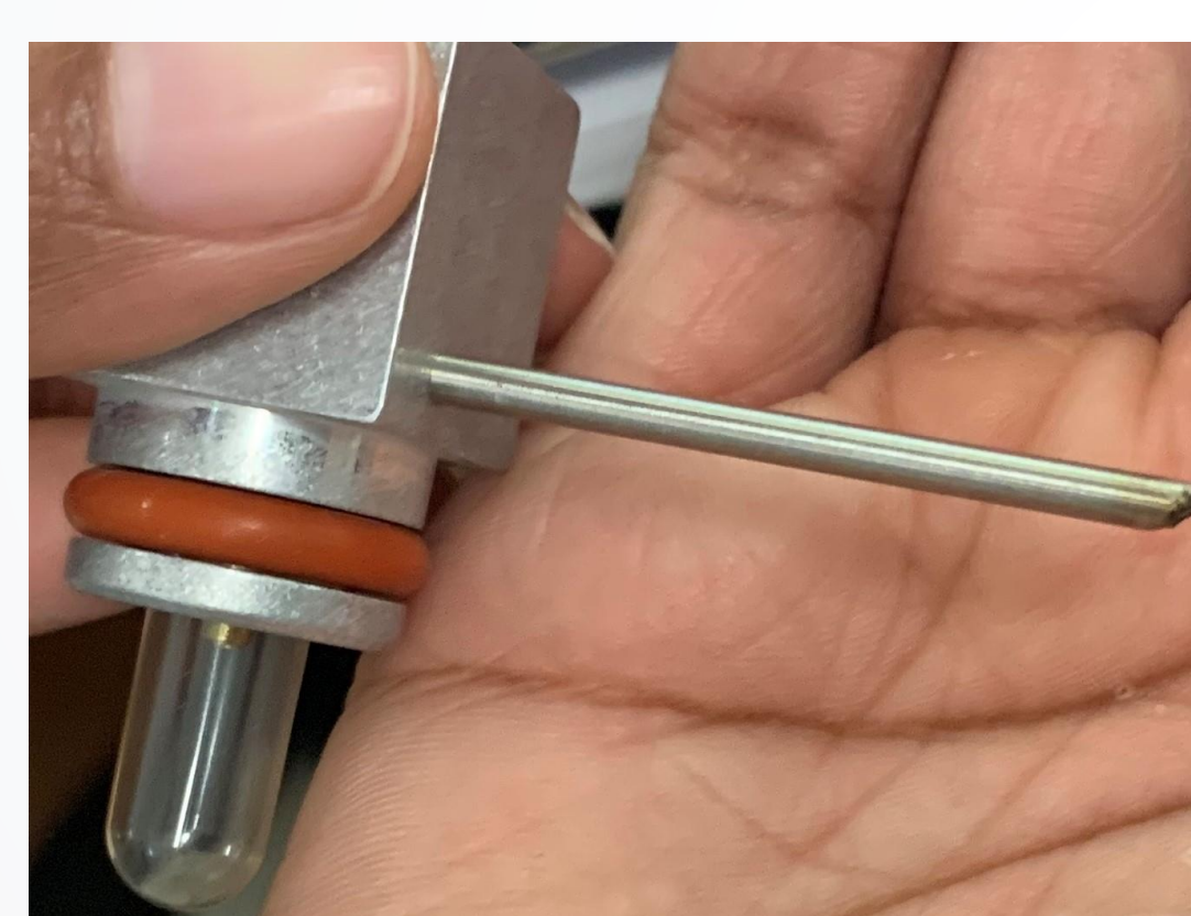
Figure 2A. Vacuum used to collect spores. Long, pointed end vacuums the spores off peanut leaves. The dissolvable pill capsule attaches at the bottom to store the spores.

Each solution was transferred to water agar, allowed to dry and incubated for 3 days. Agar sections were then moved to microscope slides, stained with Trypan Blue stain and covered with a cover slip. The number of fully germinated spores were counted to compute percent germination. Data were analyzed using Analysis of Variance in SPSS with Spore Source (vacuumed or dried leaf spots) and Tube Source (dissolvable capsule or microfuge tube) as fixed factors.