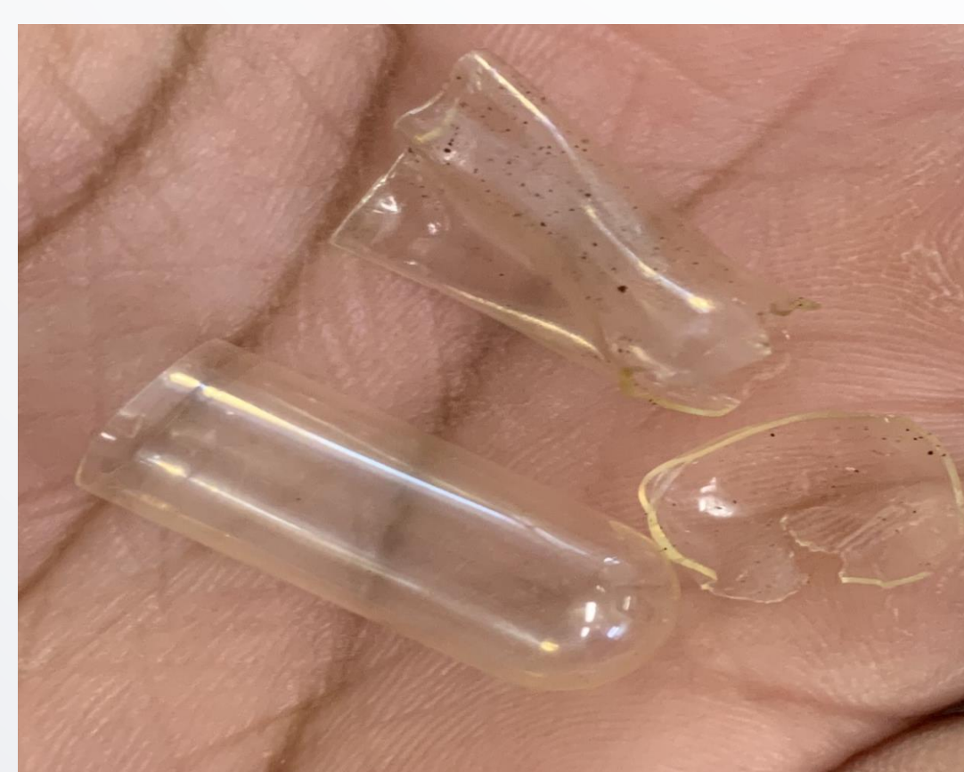
Figure 2B. Photos of both dissolving pill capsule with spores.