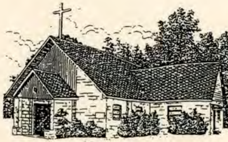
Pope's Chapel United Methodist Church