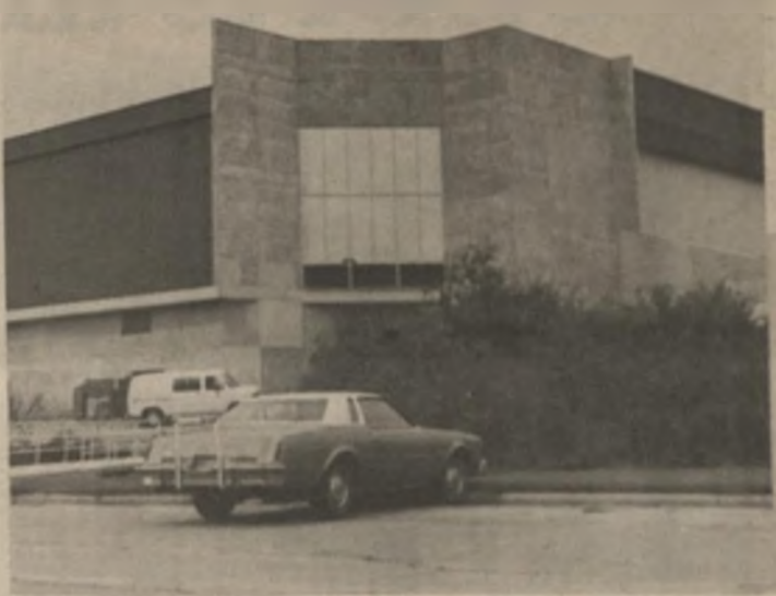
New Physical Education complex

specialty stores offer pleasant shopping. Students will find a wide selection of records and tapes at World of Records. After shopping, students can cure the munchies with custom-made sandwiches from Northside Deli. A variety of sorting goods can be found at The Sportslocker just a few yards up the road. J.C. Penney, Belk, Roses and many smaller shops are located in Five Points shopping center farther north. K-Mart is just across the street. On the corner, The Wooden Nickel offers a delightfully different menu including gyros and camel riders. For late-night partying, several places are popular with VSC students. Oyster Bay offers seafood and brew in a casual atmosphere. Students can dance the night away at Grego's or shoot a few games of pool at The Sportsman Club.