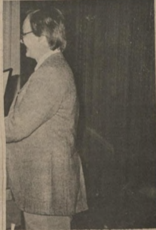
Read (see opposite photo)

enough distress when testing the class. I comfort- "The classrooms were not built to accommodate that many students. The most of the aisles are so close together it makes it ined 40 or difficult to feel comfortable to test the students," she said. problem is This problem caused by increased ng them- enrollment has very few solutions. student "We're not going to turn the has dis- students away. You can't correct it on time." unless you add more staff and that's an administrative problem of fund- causes ing." she said. "And I'm not in a position to comment on that."