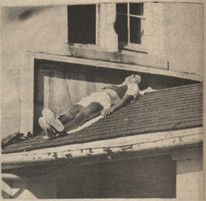
Professional tanning is a favorite sport at VSC