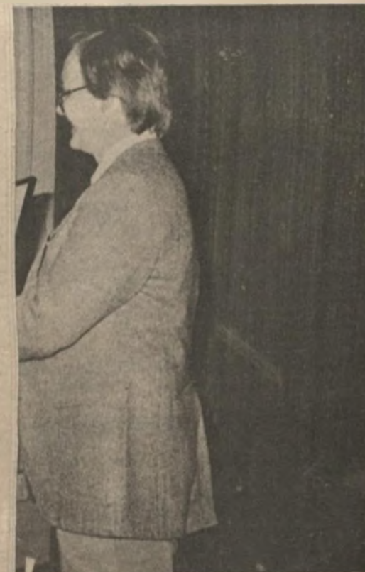
lead (see opposite photo)

"We're not going to turn students away. You can't correct unless you add more staff and that's an administrative problem of funding," she said. "And I'm not in a position to comment on that."