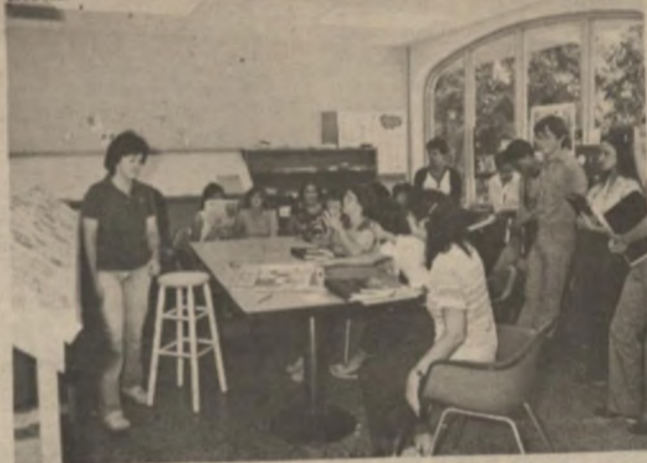
Students do most of the work on The Spectator. The staff writes stories and editorials, takes and develops photos, types copy, sells ads, lays out pages, and

The Spectator is Valdosta State's student newspaper. It is funded through student activities fees and ad revenue. The primary purpose of The Spectator is to inform students of news and events that will affect them.