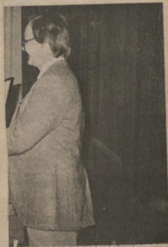
Lead (see opposite photo)

l enough l comfort- ost of the med 40 or roblem is ng them student has dis- on time," causes distress when testing the class "The classrooms were not built to accommodate that many students. The aisles are so close together it makes it difficult to feel comfortable to test the students," she said. This problem caused by increased enrollment has very few solutions "We're not going to turn the students away. You can't correct it unless you add more staff and that's an administrative problem of funding," she said. "And I'm not in a position to comment on that."