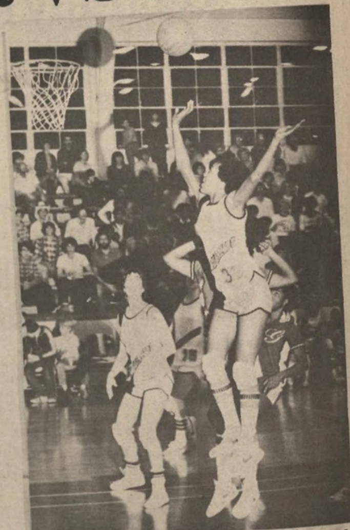
Bottom Left: Intramural softball Middle: Intramural football Above: Women's basketball