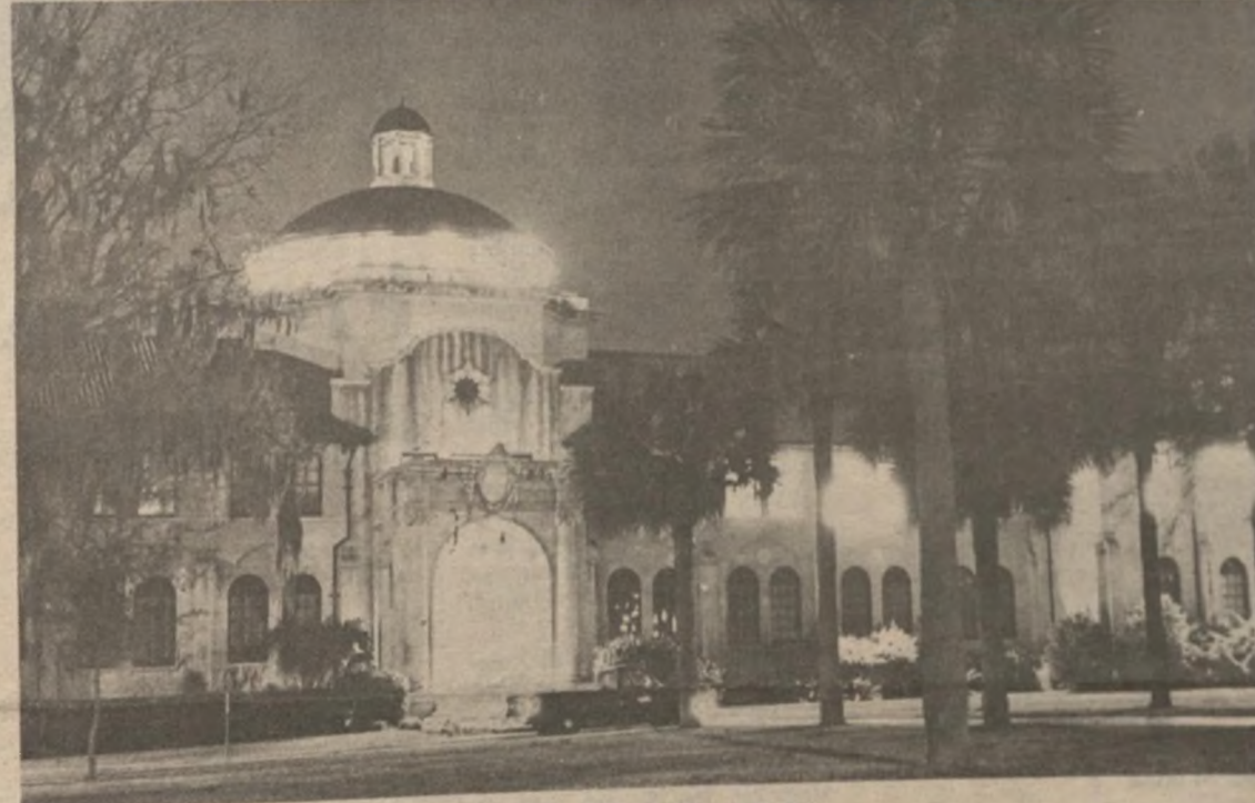
Evening view of West Hall

Valdosta State College is a multi-purpose, senior unit of the University System of Georgia. As an accredited member of the Southern Association of Colleges and Schools, VSC provides a wide range of opportunities for higher education. Undergraduate degrees in over 45 major areas of study are offered. VSC also offers graduate degrees in more than 20 fields of specialization. Over 25 completely air-conditioned buildings occupy VSC's 168 acres. Main Campus buildings are Spanish Mission architecture while those buildings on North Campus are a form of red brick Georgian architecture.