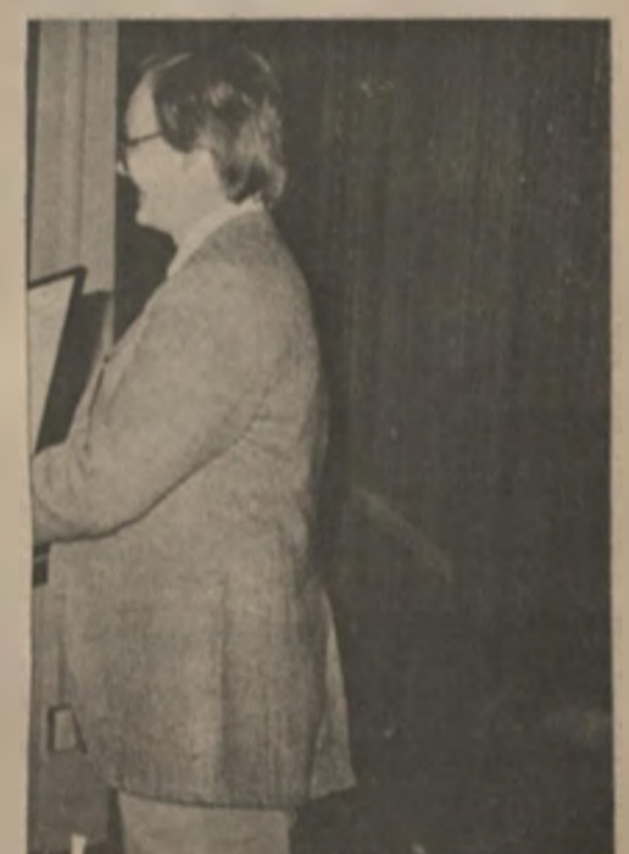
Read (see opposite photo)

held enough feel comfort most of the stined 40 or a problem is aking them for student ho has dis- ation time," ho causes distress when testing the class "The classrooms were not built to accommodate that many students. The aisles are so close together it makes it difficult to feel comfortable to test the students," she said. This problem caused by increased enrollment has very few solutions "We're not going to turn the students away. You can't correct it unless you add more staff and that's an administrative problem of funding," she said. "And I'm not in a position to comment on that."