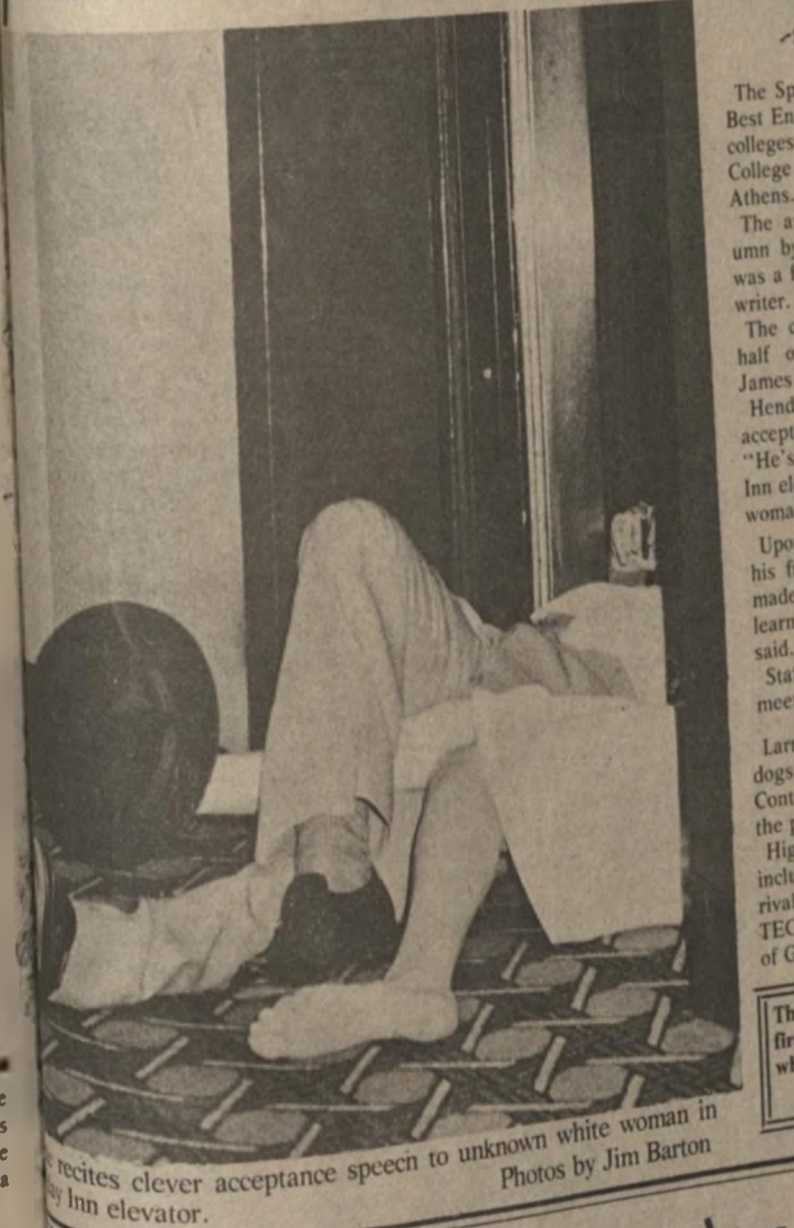
recites clever acceptance speech to unknown white woman in Inn elevator.

Producers concert to come to Valdosta --page 2