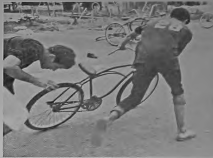
Changing riders in the relay was hazardous. One rider falls while his partner carries on with the race.