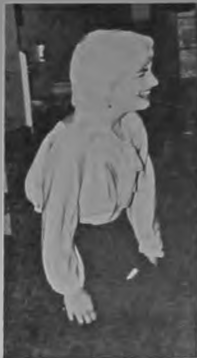
Could this lovely creature really be a VSC coed? Of course!