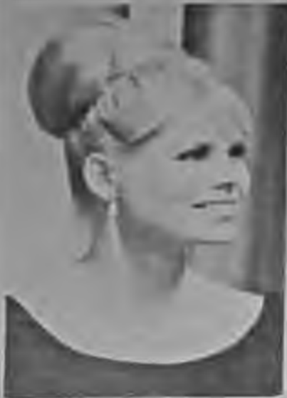
Frosh Girls' BAGBY