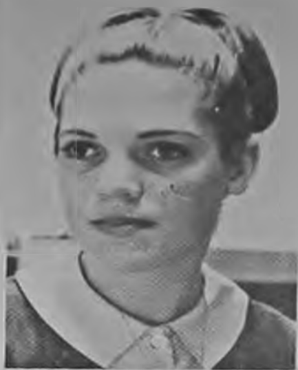
Converse Hall BAKER