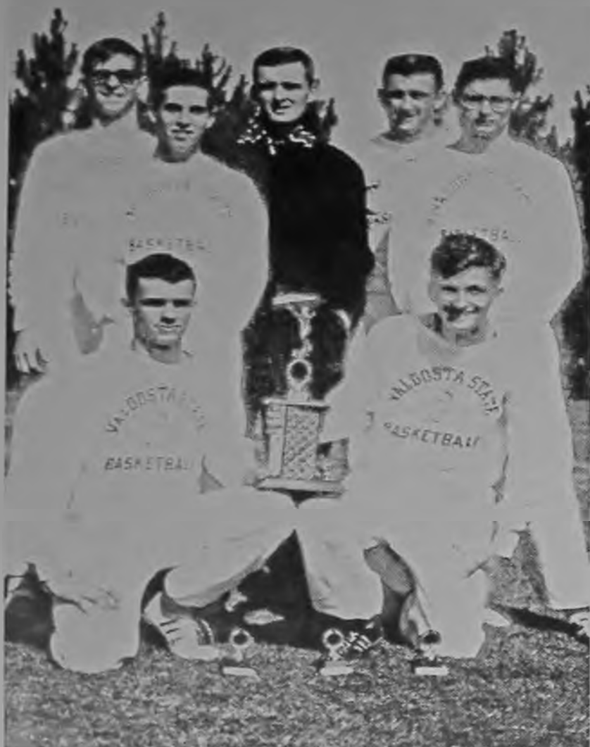
These are the members of the VSC Track Team who ran away with top honors, October 30 in Carrollton. The money collected by the SGA from the Valdosta "500" will be used to help send the track team to the Spring Quarter Track meet in Rome.

New York City may be the country's melting pot, but it's Washington, D. C., where all the stews are made.