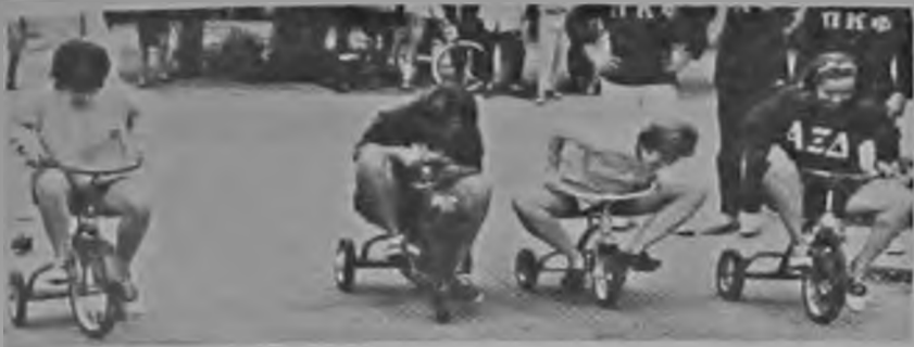
The girls got in on the act by racing on tricycles