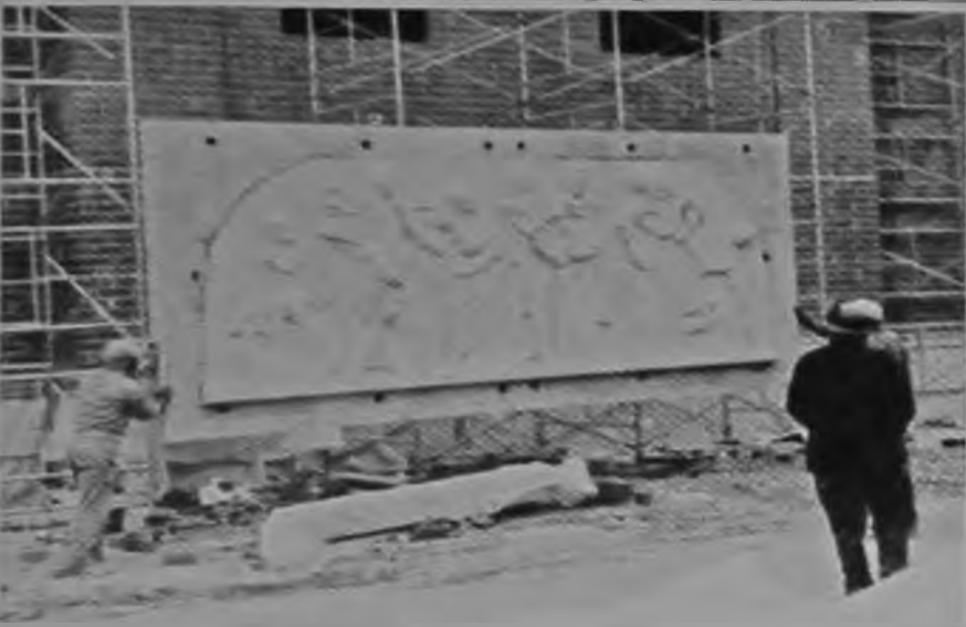
Workmen prepare to put sculpture in place on the new administration building.