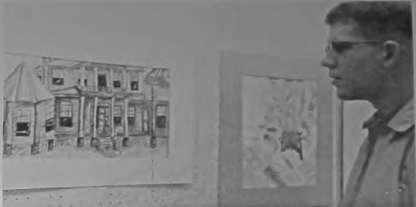
David Quarterman visits the current art display at the VSC Library.

You can't no more explain what you don't know, than you can come back from where you ain't been!