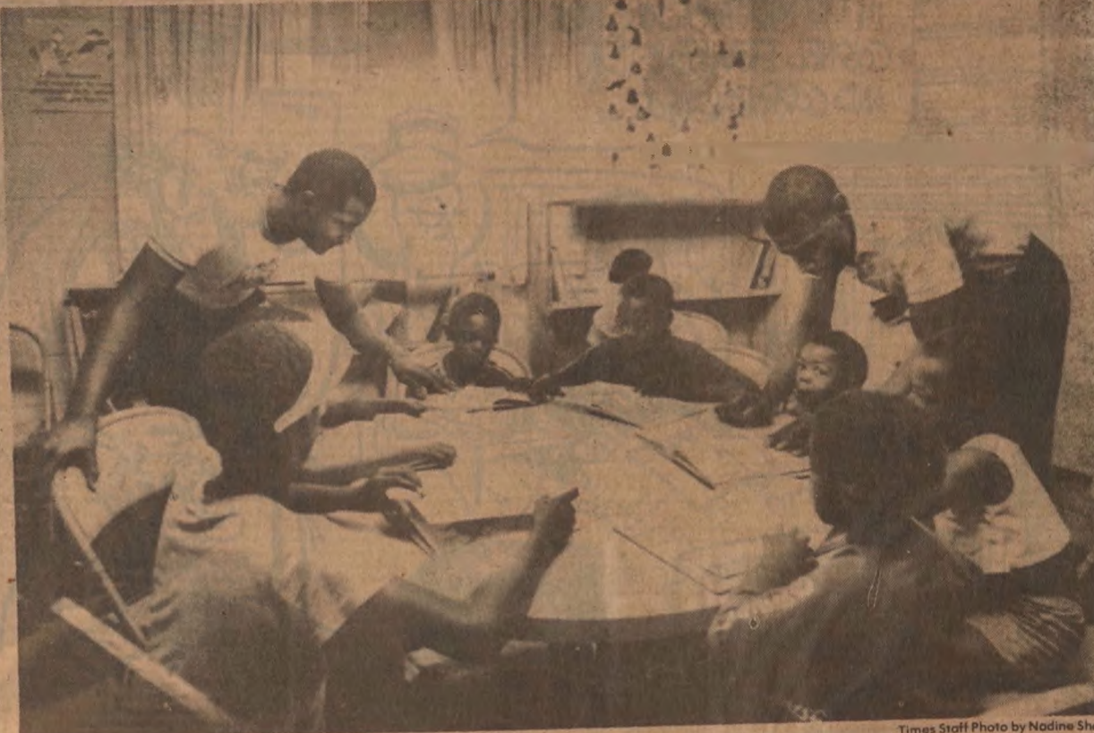
Children Read In Library-Study Hall

The RIF program will operate from the center.