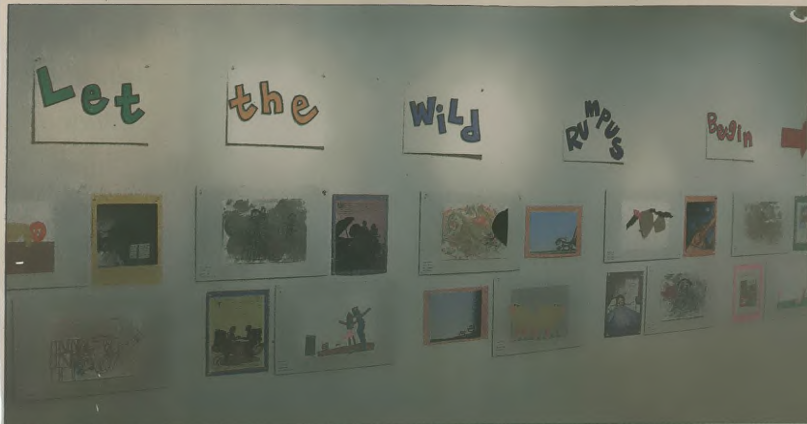
Artists are presenting works in the Annette Howell Turner Center for the Arts' Roberta George Children's Gallery.