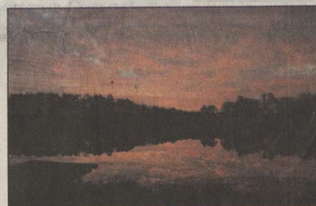
OVER THE RAINBOW FIRST PLACE: 'Sunset on Lakeshore,' Sally Querin.