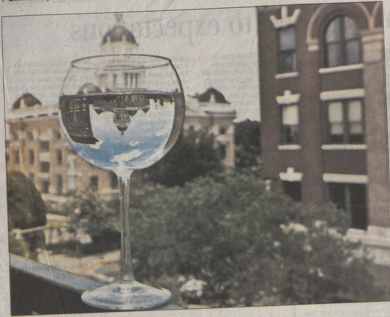
BEST OF SHOW: 'Upside Downtown,' Lin McMichen.