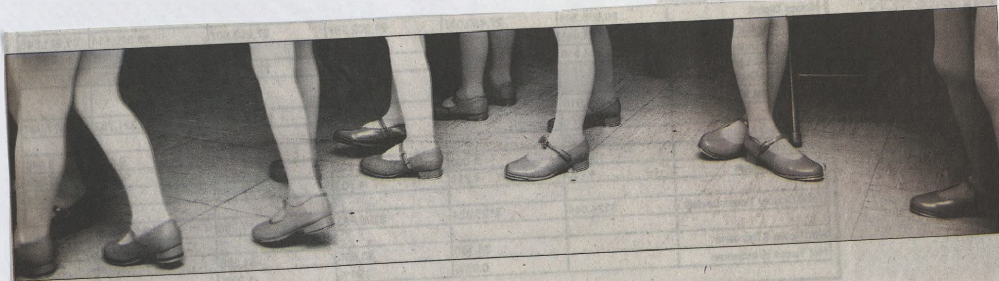
LIGHT, CAMERA, ACTION FIRST PLACE: 'Backstage Sass,' Lin McMichen.