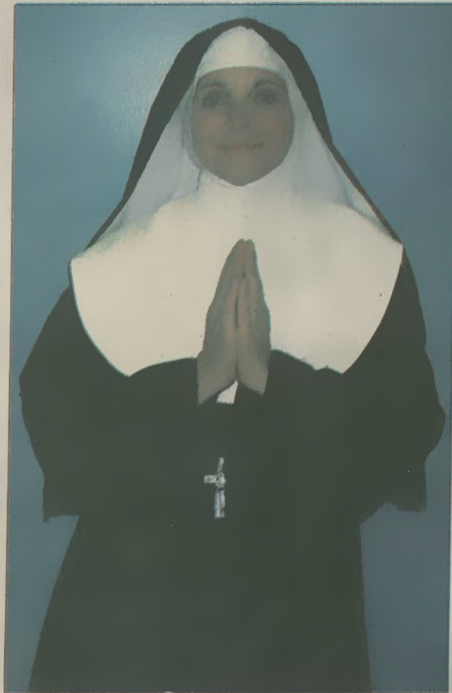
NUNSET BOULEVARD stars Cindy Williams, plays Oct. 23.

The Presenter Series Synopsis: "Take a nostalgic