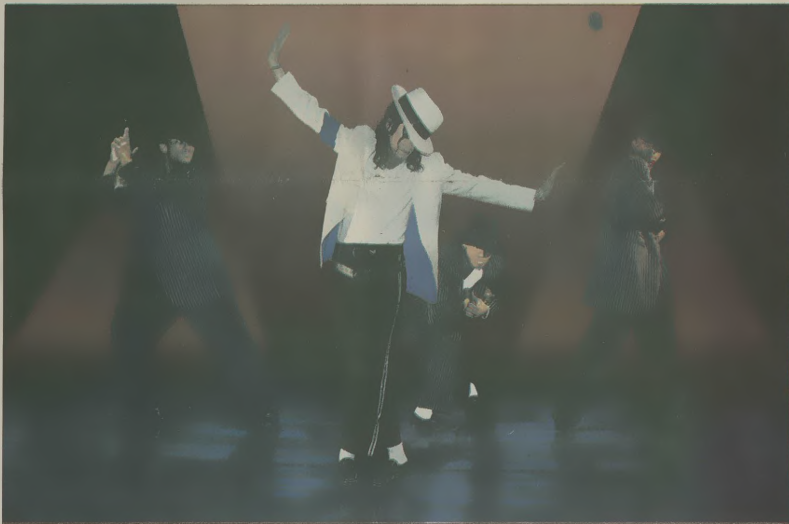
KING MICHAEL: Sept. 27.

This Presenter Series kick-off show also has a reduced individual ticket price of $30 compared to $45 for the season’s other individual show tickets.