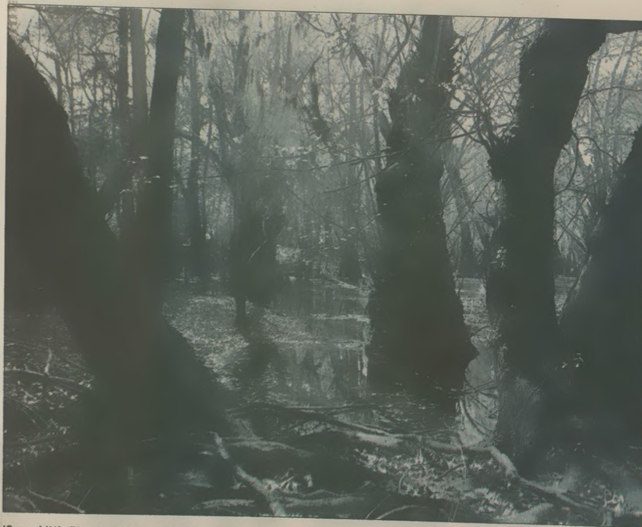
'Gums Little River,' artist Dominick Gheesling.