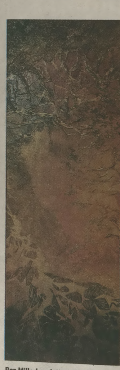
Roz Miller's painting titled 'Intrigue'