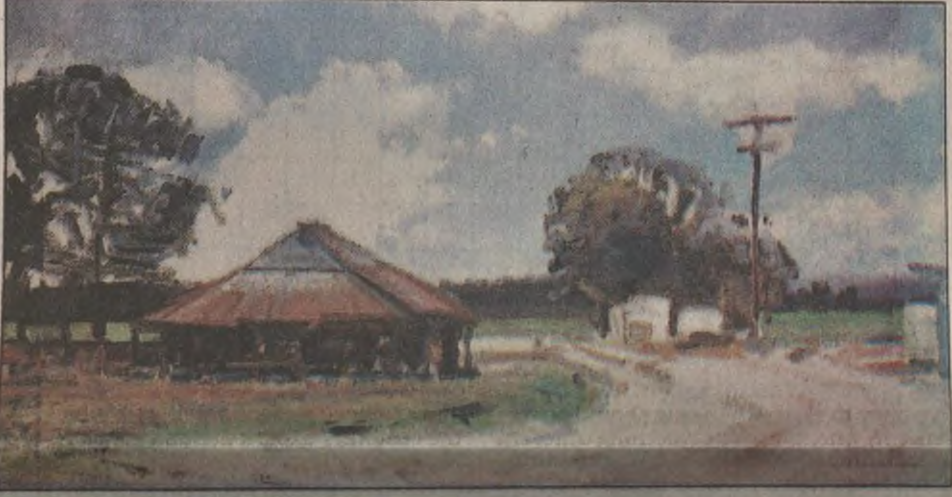
'Planting Carrots,' artist Todd Wessel.

Wessel captures often breathtaking impressions into the heart of Valdosta landscapes.