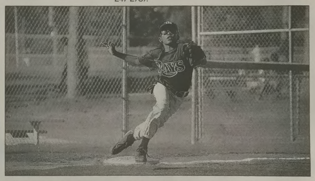
Untitled image by Joshua C. Lynch. A past first-place winner in the Valdosta People's Choice Photo Contest.