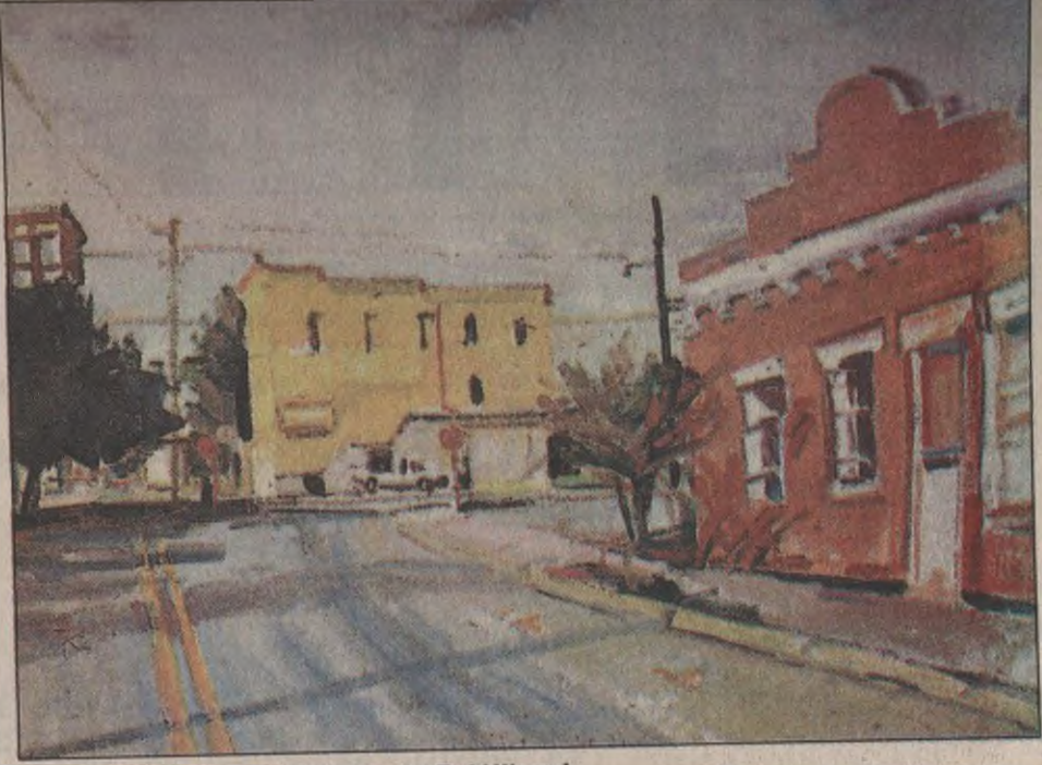
'Old Southern Salvage Building,' artist Todd Wessel.