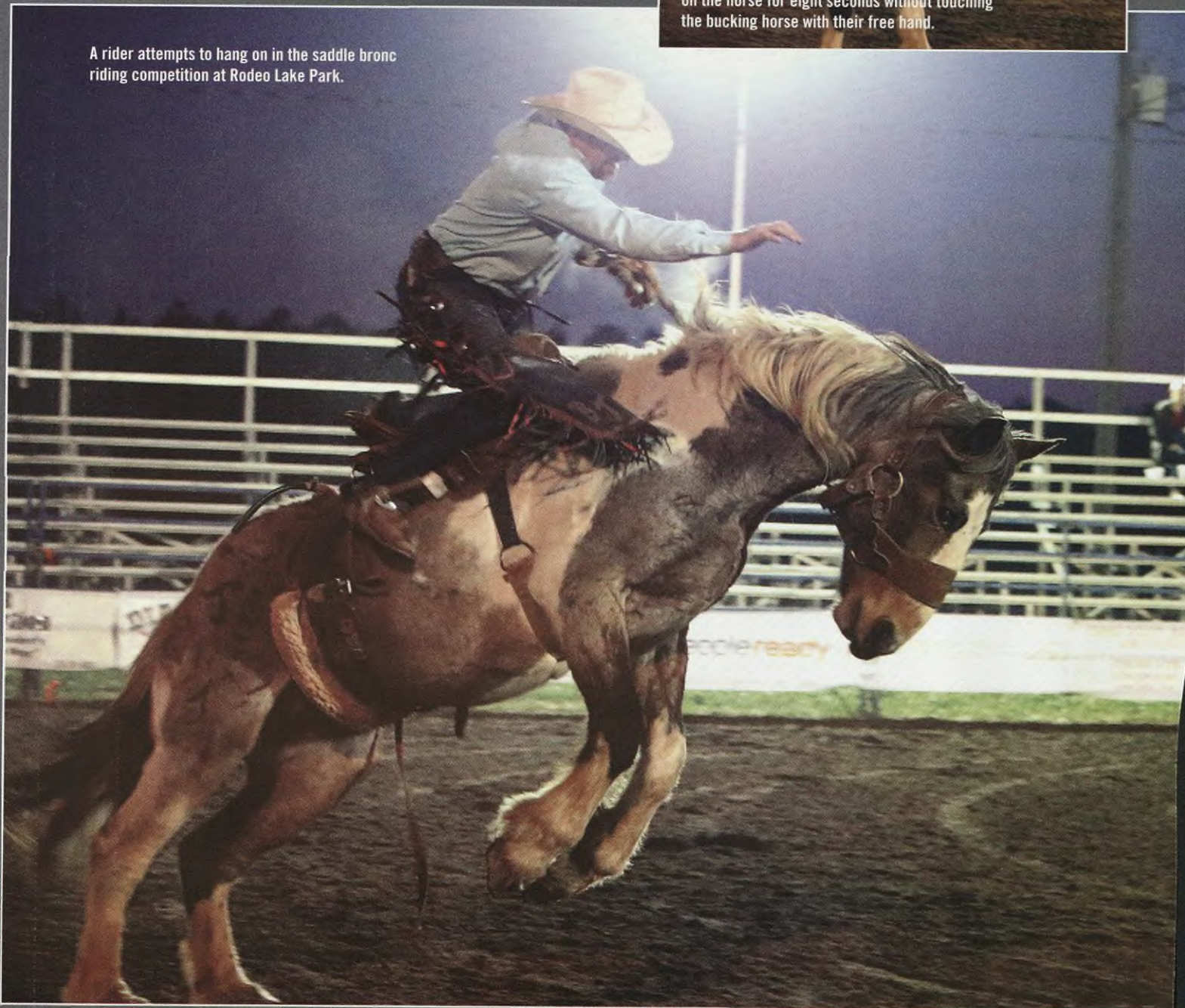
A rider attempts to hang on in the saddle bronc riding competition at Rodeo Lake Park.