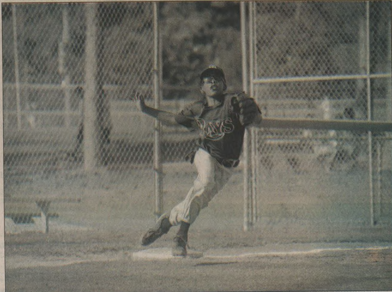
Untitled image by Joshua C. Lynch. A past first-place winner in the Valdosta People's Choice Photo Contest.

The top photo in each category will garner the winning photographer