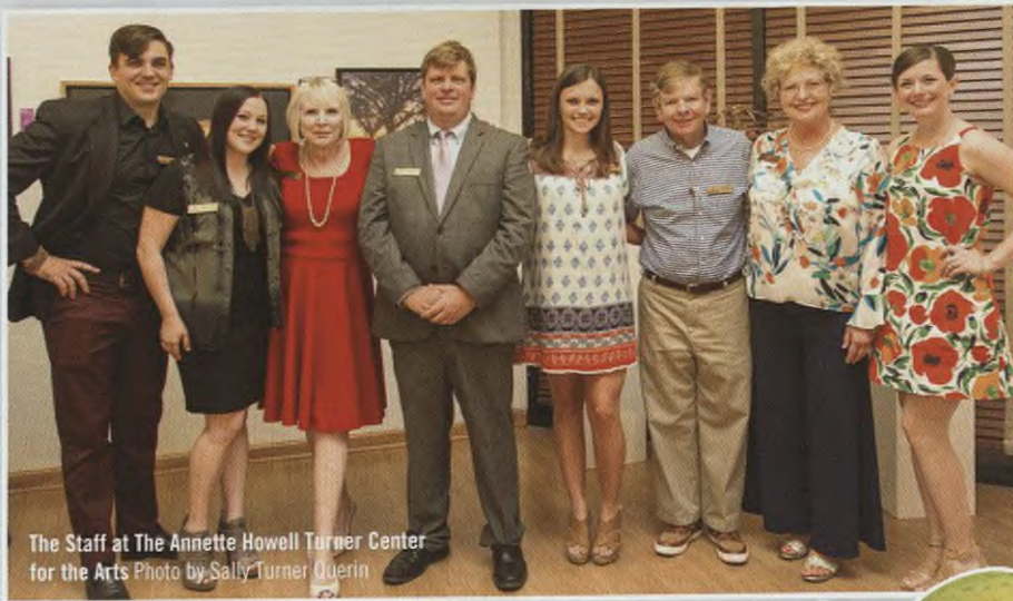
The Staff at The Annette Howell Turner Center for the Arts