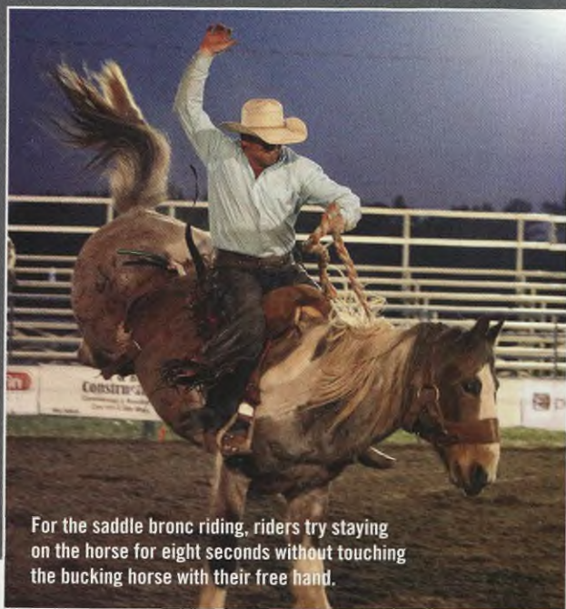
For the saddle bronc riding, riders try staying on the horse for eight seconds without touching the bucking horse with their free hand.

Rodeo Lake Park hosted professional and local cowboys and cowgirls in March. The rodeo was at Raisin' Cane and featured calf roping, bull riding, cowgirl barrel racing, bareback bronc riding, steer wrestling, breakaway roping and team roping.