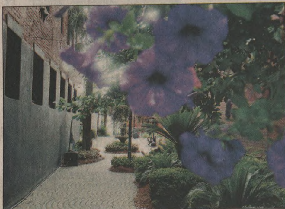
'Purple Passion' by Leo Soilea. A first-place winner in the Valdosta People's Choice Photo Contest.