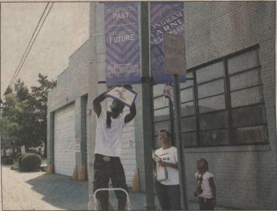
AMANDA M. USHER | THE VALDOSTA DAILY TIMES

The CCAD extends northern two blocks to Webster Street to be inclusive of the Turner Center and Turner's Hudson Pot-