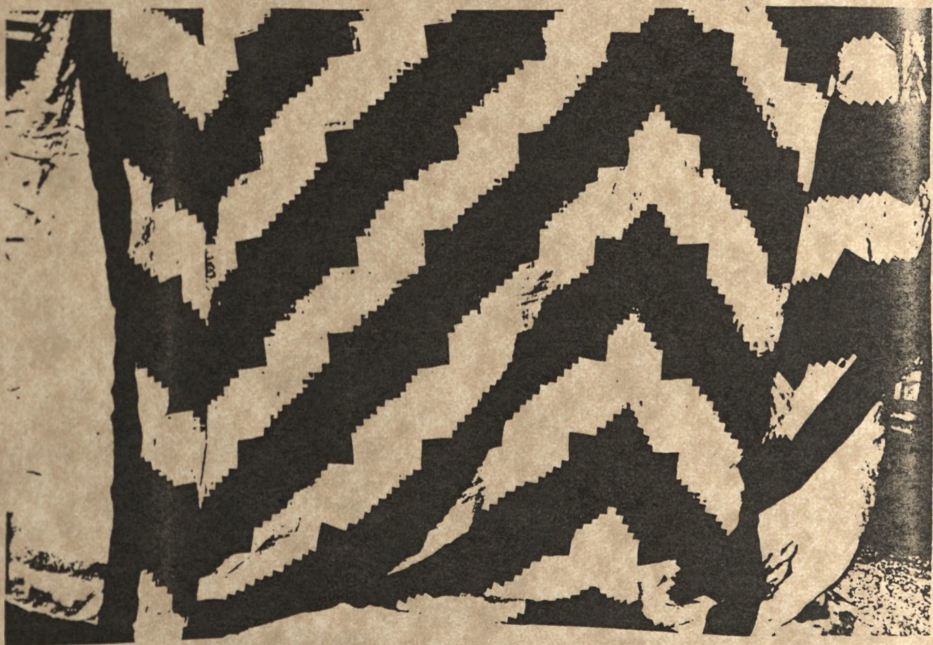
Silk - Log Cabin - Black & White