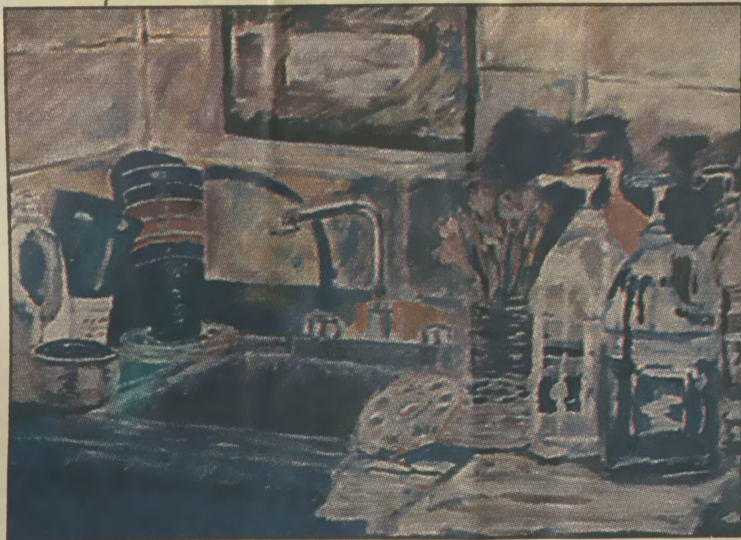
'Sherbert Walls', acrylic, Benjamin Winslow.