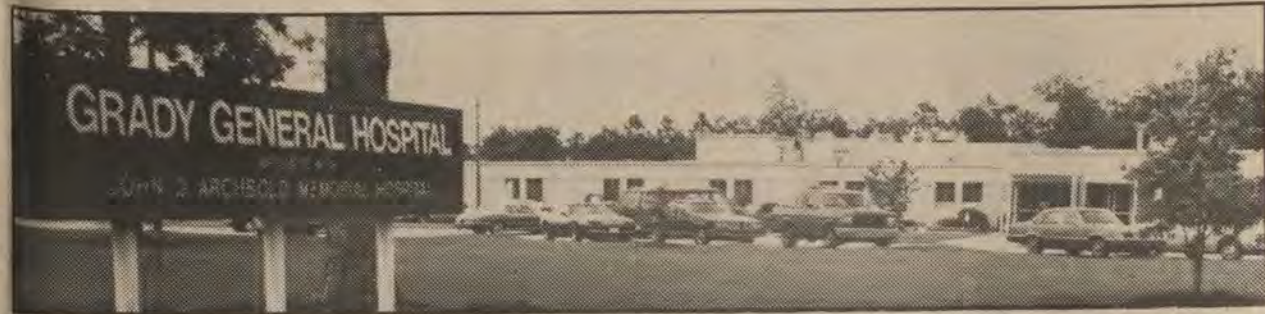
Grady General Hospital serves community with high-quality care, dedicated personnel