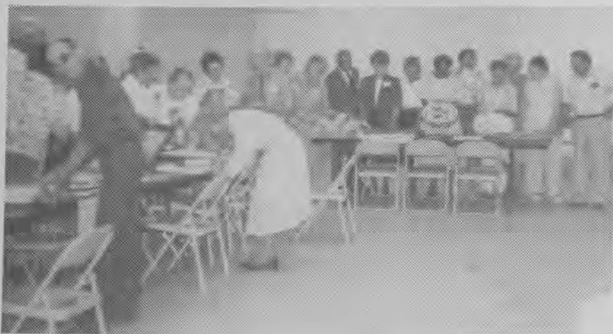
Activity day at the Senior Citizens Center.