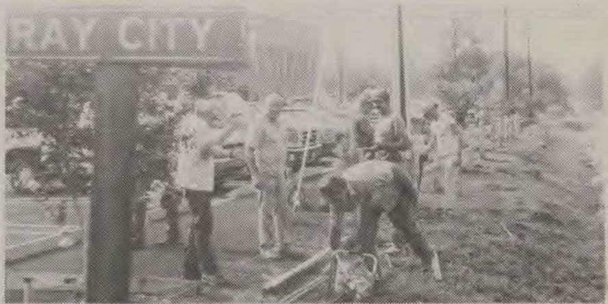
Workers assemble split rail fence as part of the beautification project along Paralled Street parking lot.