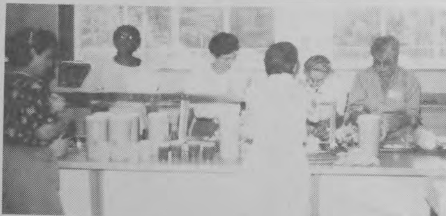
Time to eat! Ray City's "Nutrition Program" for Senior Citizens.