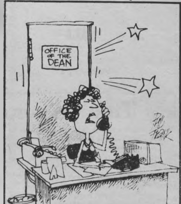
THE DEAN'S MEETING WITH SOME STUDENTS - CALL HIM LATER AT THE HOSPITAL!