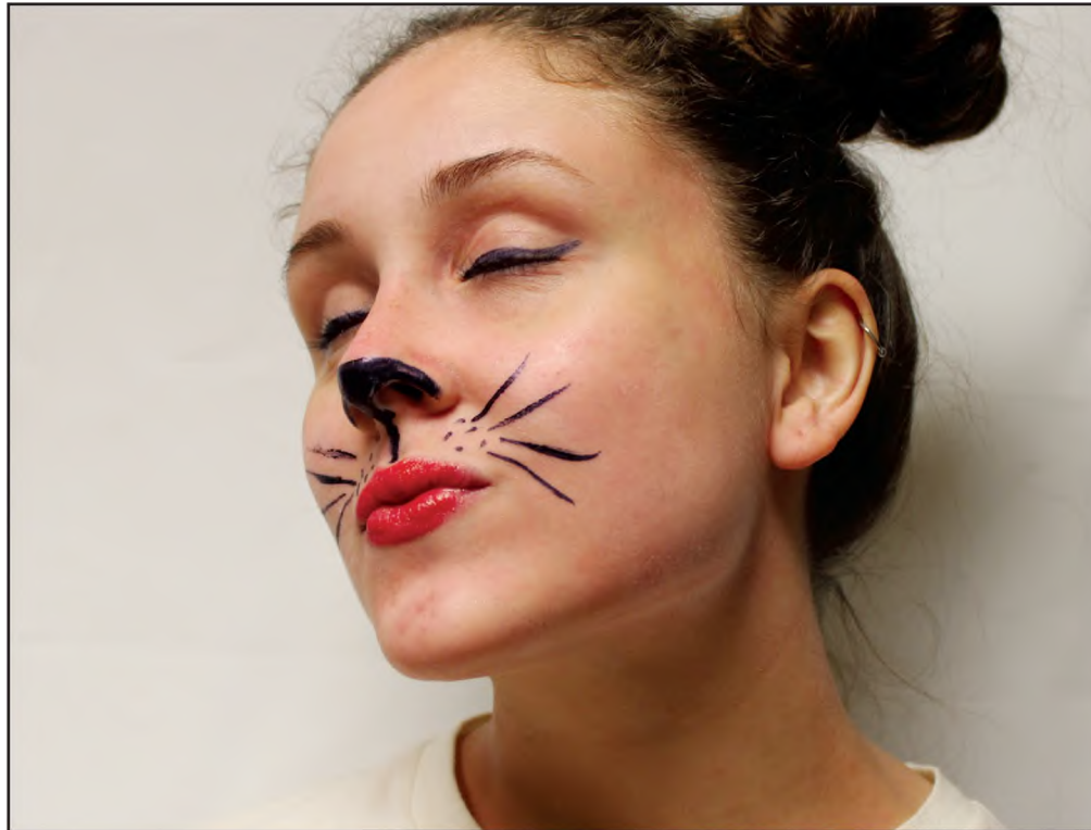
Create this mouse look with a dark liquid eyeliner and a red lipstick. Put your hair up in two buns to represent your ears and you'll be good to go.

Give yourself two rosy cheeks by drawing red circles on your cheeks and then, if you're going for the puppet look, draw two black lines from the corners of your mouth down your chin.