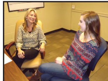
First Year Learning Communities