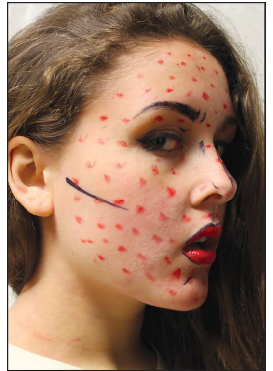
Use your favorite nude or red lipstick and black eyeliner to create this comic book pop-art inspired look.

If you're trying to be a mime, put a little of the red lipstick in the center of your lips to make them appear smaller and draw small thick black lines from the middle of your top and bottom eyelids, grab a plain black shirt and pants from your wardrobe to complete the look.