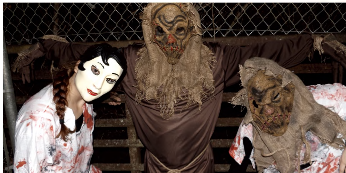
Student "scarers" working at the trail pop out randomly along the way.