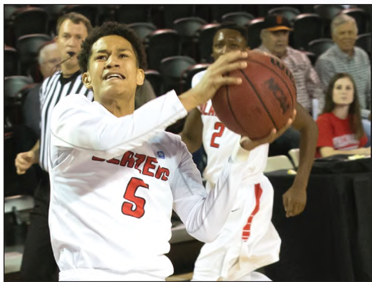
VALDOSTA STATE UNIVERSITY

On Thursday, the Blazers will play the Flames at the Complex at 7 p.m. VSU will then wrap up their season on Saturday against Shorter University at 7 p.m. at the Complex.