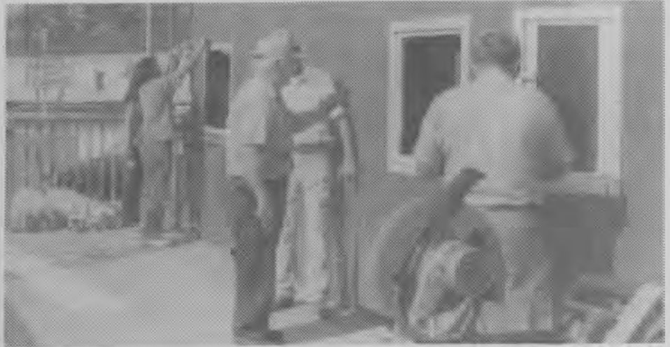
THE CITIZENS OF RAY CITY coming together to help restore the Caboose. The Caboose is expected to be completed by April 1992. A project like this takes patience, volunteers and most of all teamwork.

If you are interested in helping with this years activities, you should contact City Hall or any council member.