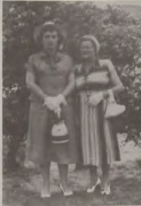
Do You Recognize These Ladies They Are Two Of "Our Own."

Let's support our school by supporting our Alumni on February 1st!