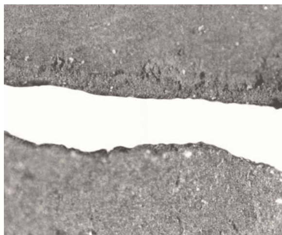
Figure 3. Optical micrographs (40 ×) of actual (above) and simulated (below) Type B solids.

According to Schwertmann and Cornell (2000), the hydrated ferric oxide most likely to form under steam generator conditions and in the laboratory studies simulating these conditions is ferrihydrite, because its