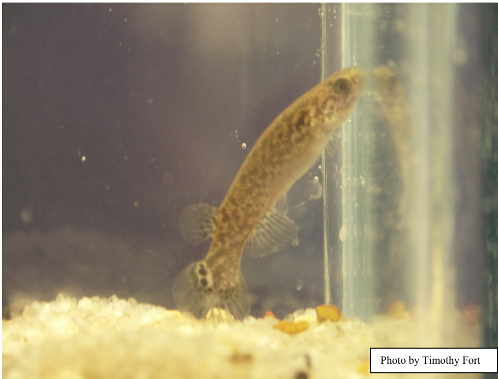
Figure 2.1: Kryptolebias marmoratus Genders. (A) Adult hermaphrodite. (B) Adult male.