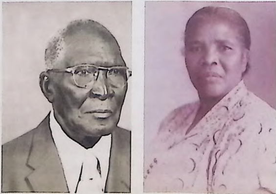
Mom and Dad

As we move on with this account, I must repeat, I honestly had a happy and eventful childhood—being the tenth of eleven children played a large part in this fact. I would be remiss if I did not recognize the stable, comfortable, and safe environment in which my siblings and I grew up. I cannot recall a time when we were hungry, and did not have anything to eat. Our parents saw to that. They raised us by the teachings in the Good Book to “love each other and to do unto others as we would have them do unto us.” We were taught to live truthful lives, be honest, dependable, compassionate, and help those less fortunate. Our father and mother were both excellent role models for their children.