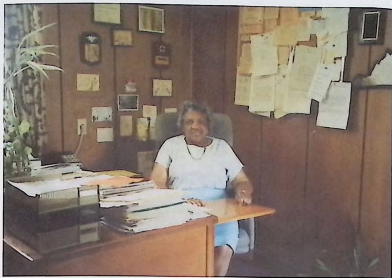
Me at my desk

After the merger of these two agencies, the Board of Directors of Wesley Community Centers and the Savannah Housing Authority reached an agreement for Wesley Community Centers to utilize one of the housing units in Hitch Village, a low-income housing project near the former Inner-City Center, in exchange for an educational program for preschoolers, known as "Play School." An after-school program for school students up to age twelve was also housed in this unit. This location became known as the "Eastside of Wesley Community Centers."