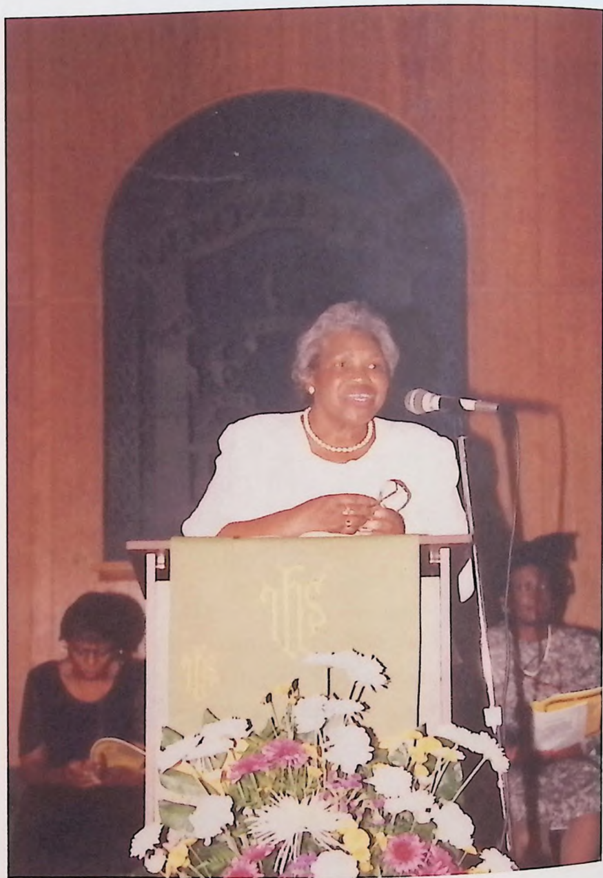
Me at podium