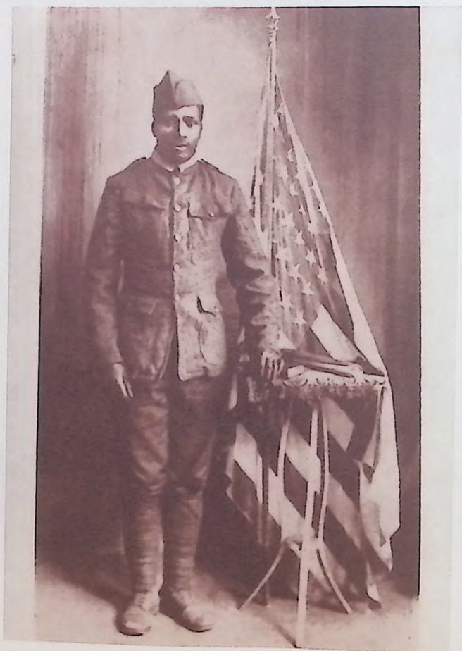
Dad in uniform

Both of our parents' families were well-known in the community. They were well respected, good providers, and lived peacefully with their neighbors. They were Christians and leaders in their churches and their communities. Our daddy was a World War I veteran and served in France during the war. He was eulogized as a Bible scholar, Lay Preacher, and Thirty-Second Degree Mason. He taught many of his children in Sunday School, including me.