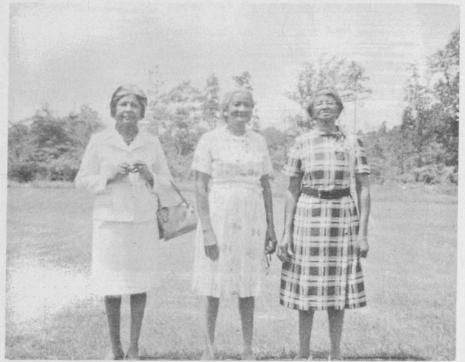
Clerk and Deacons Wives