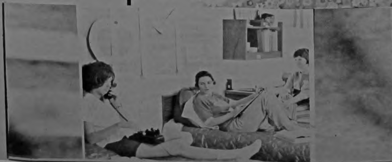
THIS ONE ISN'T