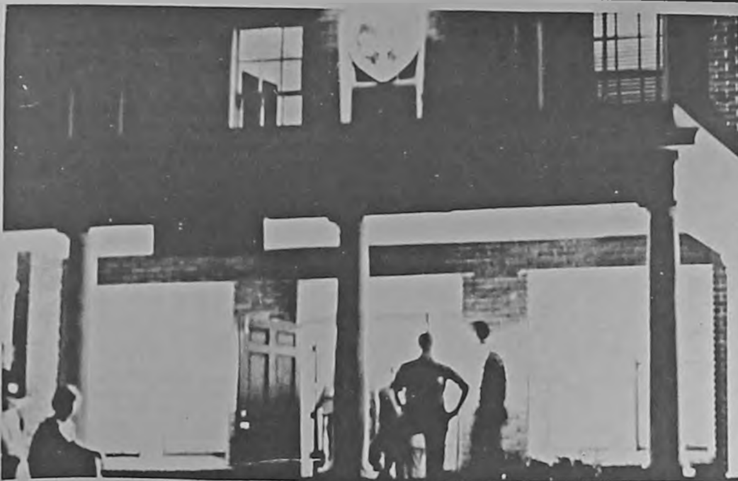
FRATERNITY HOUSE ON PARTY NIGHT