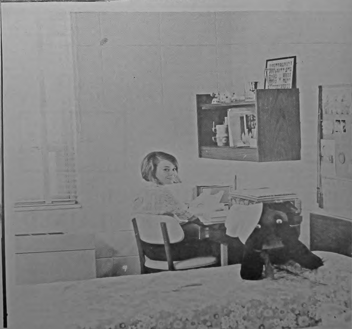
ROOMS ARE SMALL BUT THIS ONE'S NEAT