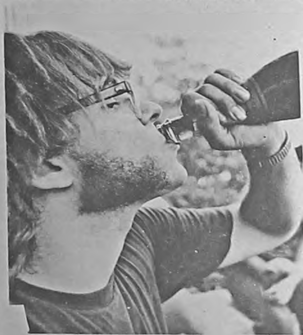
"ELECTRIC BILL" -STARRY-EYED AND WAVY HAIRED