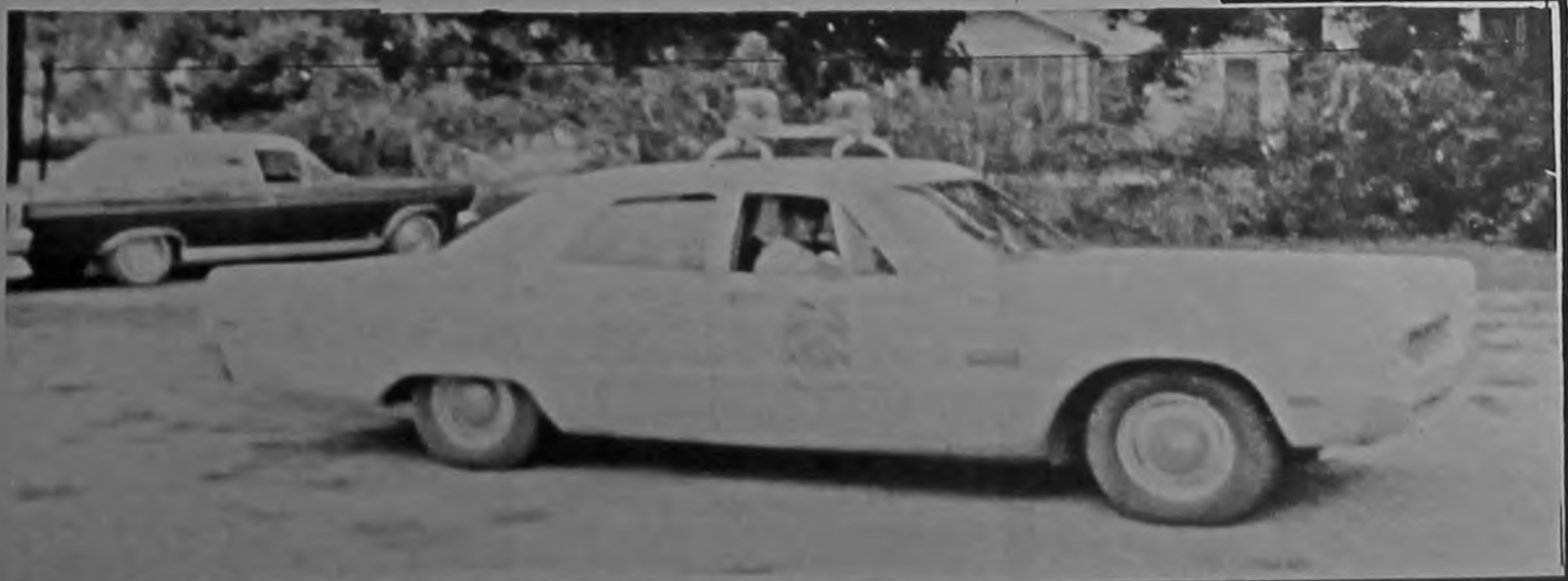
WAY IT ENDED