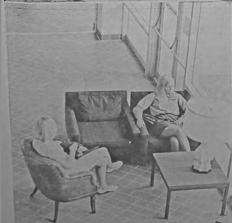
SPACIOUS LOBBY LOOKS OUT ON OPEN-AIR PATIO