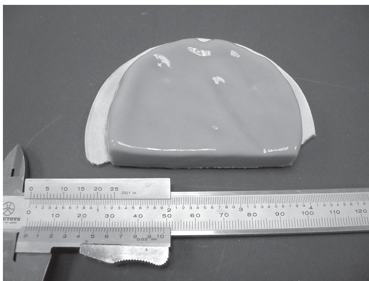
Figure 2. Photograph of a bentonite filter cake showing an indistinct and uneven slurry–cake interface at the top despite careful handling.

The present authors suggest that the greatest uncertainty in the original authors’ permeability analyses is actually the measurement of the effective cake thickness. This is because the actual slurry–cake interface is difficult to define (as noted by the authors) and the surface of the cake is rarely completely flat (Figure 2). With this in mind, the thickness of a filter cake can be measured meaningfully only to perhaps 0.5–1 mm. The authors report their measured cake thickness to the nearest 0.25 mm (figure 10 of Nguyen et al. , 2012); are they confident that their results were accurate to 0.25 mm?