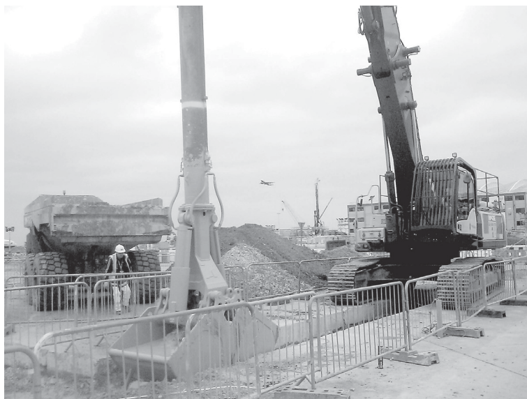
Figure 3. Possible disturbance to the under-slurry filter cake by the digging tool.