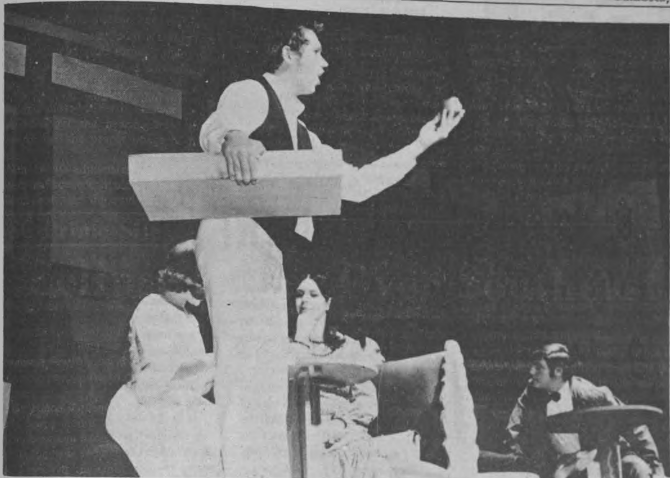
"Sunday Excursion" precedes "Down in the Valley"