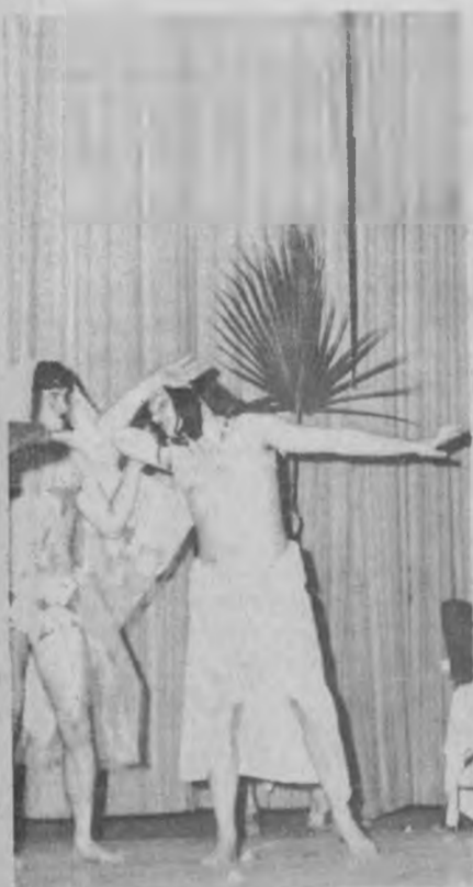
Sigma Phi Epsilon Talent Skit