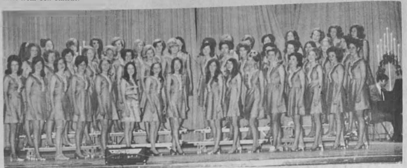
Sorority Song Fest