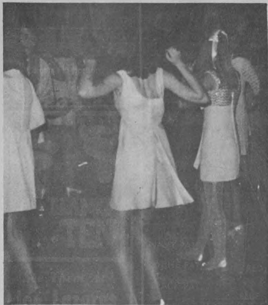
Greek Week Dance