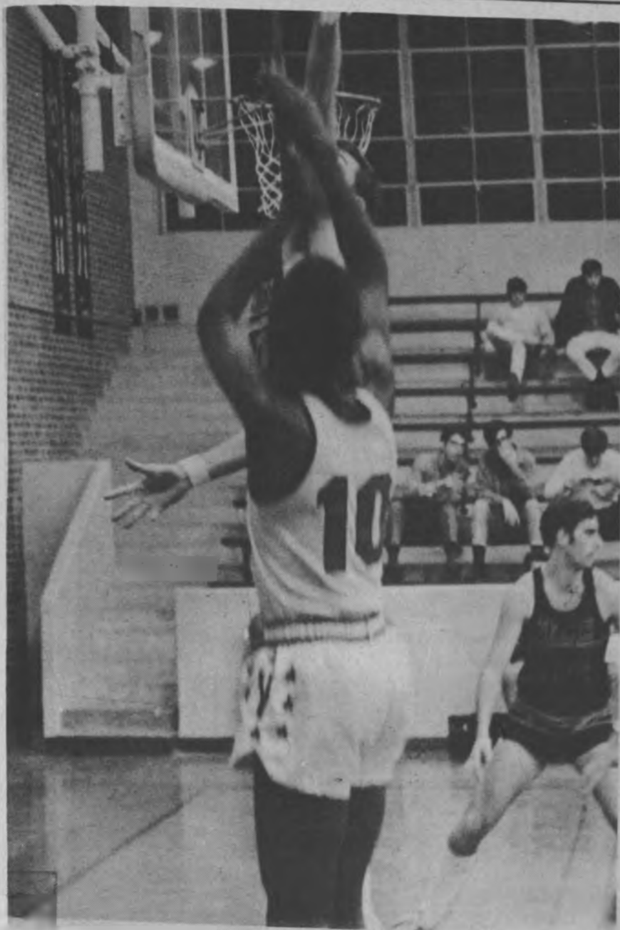
Reb shoots for basket.

A student has lost two pamphlets Area Vocational Education Program and the 'Vocational Education Act of 1963.' Anyone finding these books should call 242-0396.