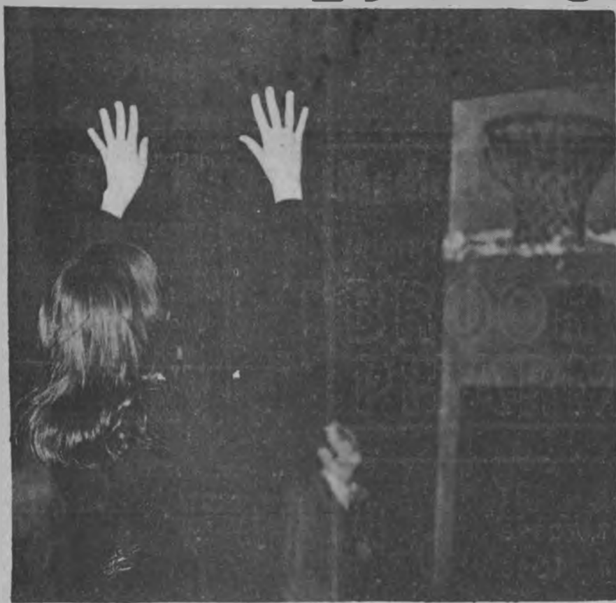
Carnival provides entertainment for all

Greek Week 1970 was not out-maneuvered by the weather this year. The sunny and mild weather during most of the week was a welcome relief over last year's Greek Week.