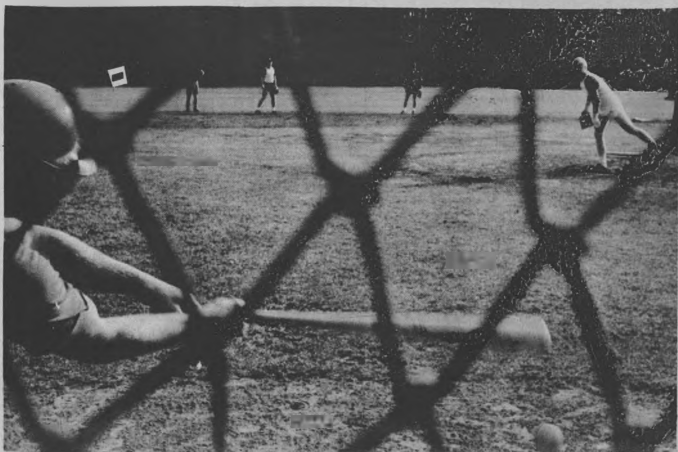
Rebels hope to retain championships.