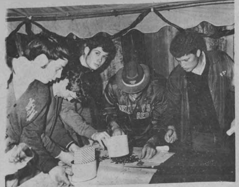
Gambling brings money for scholarship