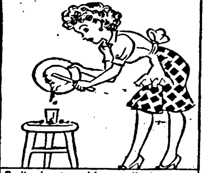
Don't make extra work for yourself trying to save your used kitchen fat in too small a container. Get up a convenient-sized, accessible receptacle for all meat scraps and table scrapings. When this is full, melt down the contents and transfer the liquid fat into a tin can for the meat dealer.