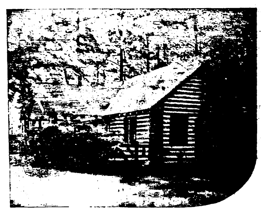
The Student Activities Building built in 1938 to house offices of the PINE CONE, Y. W. C. A. and THE CAMPUS CANOPY, and to provide a place for student recreation,

Then, slowly and gradually, the music changed from folk songs to religious carols, and they marched out of the baronial hall to the strains of "Silent Night, Holy Night." This background gave the students a deeper feeling and appreciation for the spirit of