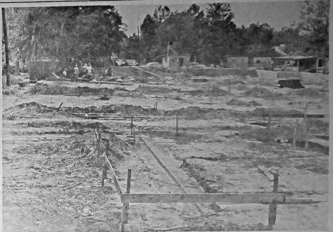
THE NEW GYM UNDER CONSTRUCTION