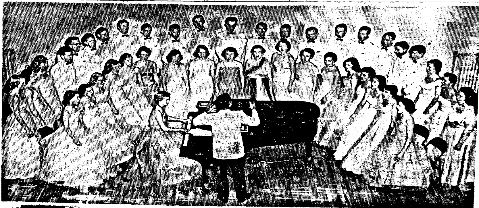
VALDOSTA STATE COLLEGE GLEE CLUB