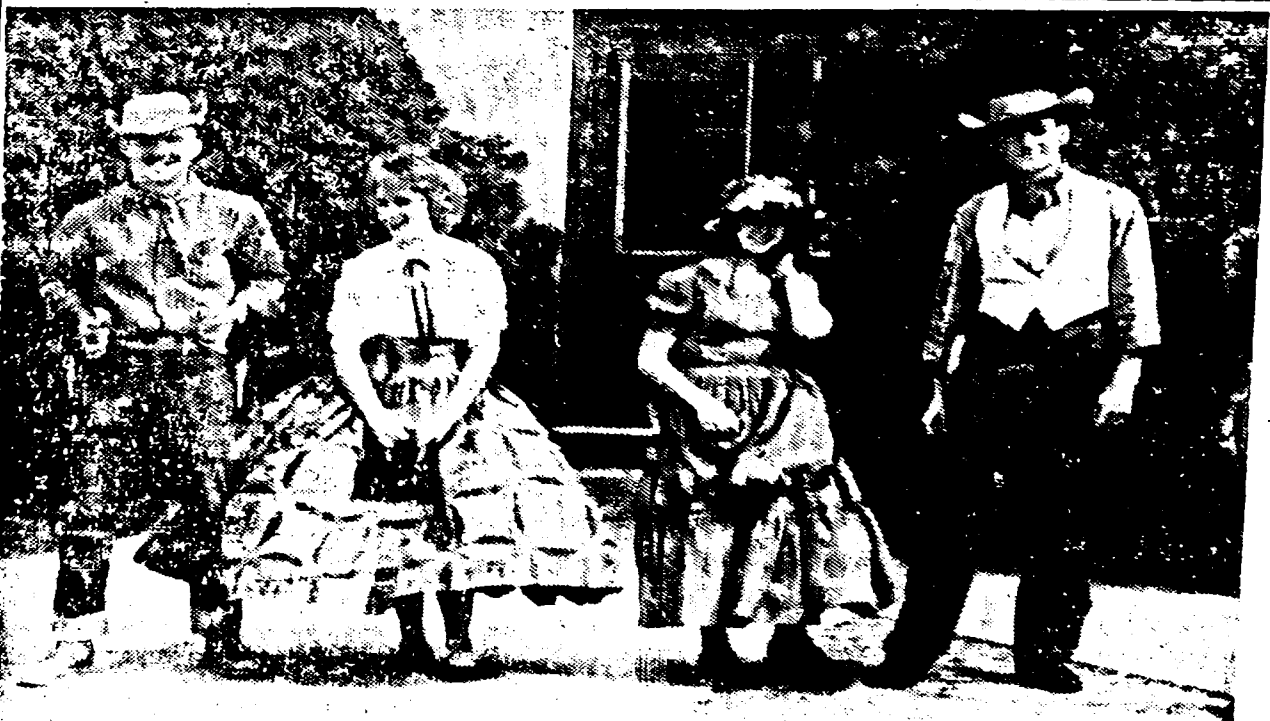
LOOK BOYS! REAL FEMININE, girl-type girls! Better than the leotard look, isn't it? And what do you girls think of those old-fashioned He-Men.

Confucius say—"To be Excellent when engaged in administration is to be like the North Star. As it remains in its one position, all the other stars surround it."