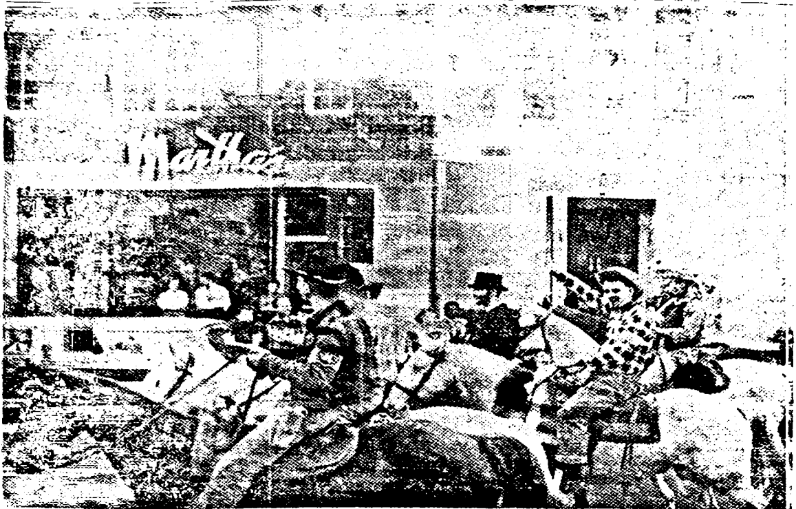
These are the cowhands from the Circle K Ranch, located in these here parts. When this picture was taken they were looking for Outlaws and Indians, because the Circle K hands are the "good guys."

Look for more on the Rebels next issue as we shall have a rundown on all the players.