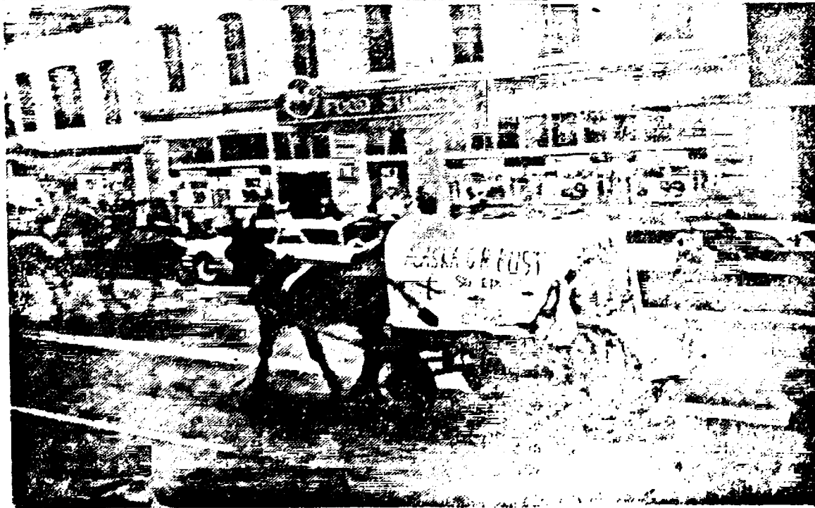
Now here's a nostalgic sight! Especially for some of the professors, who first came to VSC by this mode of transportation. But for the students it is only familiar through fireside stories and the movies.

Confucius say—"Great Man seeks to be slow of speech but quick of action."