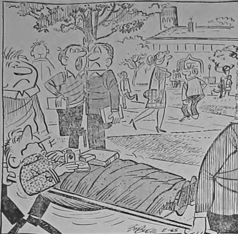
"BY THE WAY, ED, SOME OF TH' PROFS AROUND HERE ARE REAL STRICT ABOUT CLASS ATTENDANCE."