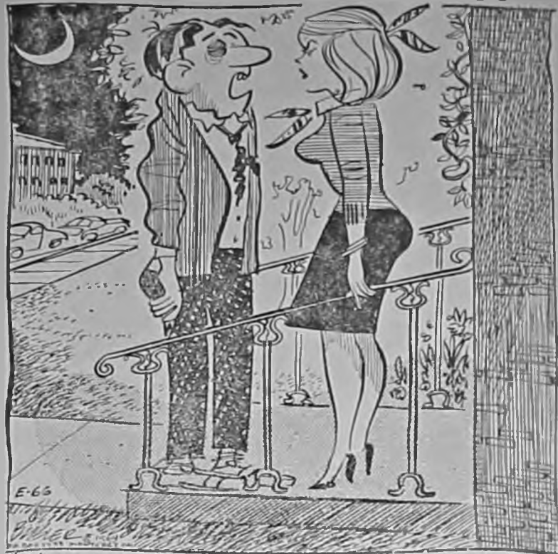
"WITH THAT ONE EXCEPTION DID YOU HAVE A GOOD TIME?"