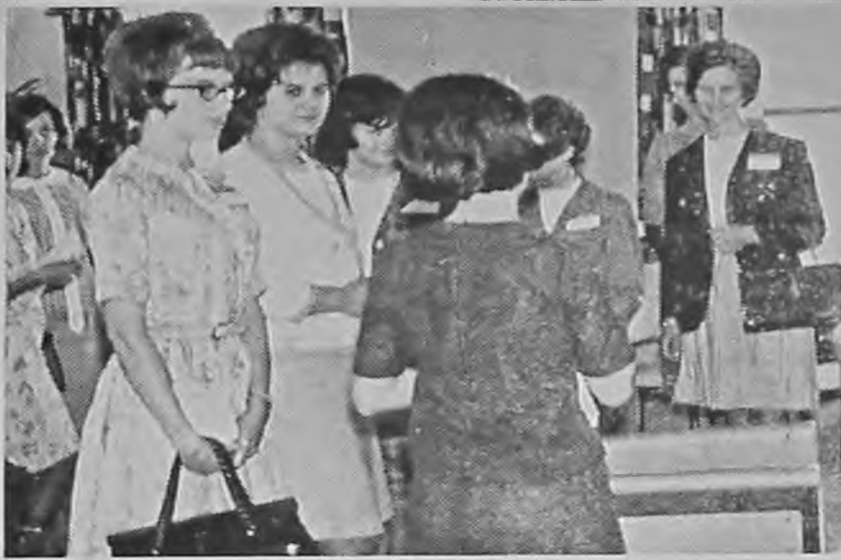
High school seniors tour Hopper Hall on their visit to Valdosta State College for Senior Day, April 2.