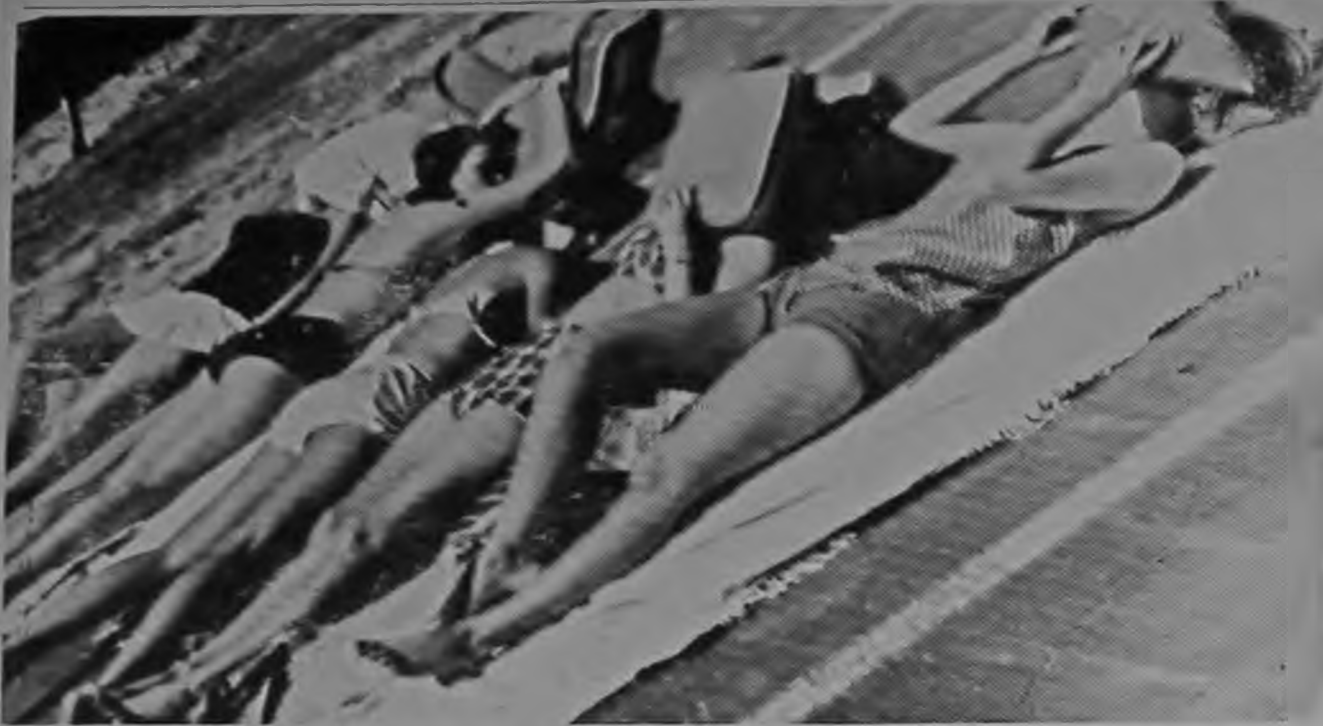
Campus beauties sunning behind Reade Hall almost unnerved roving campus photographer. Recovering his composure, he managed to snap their picture and leave without casting a shadow over the occasion.