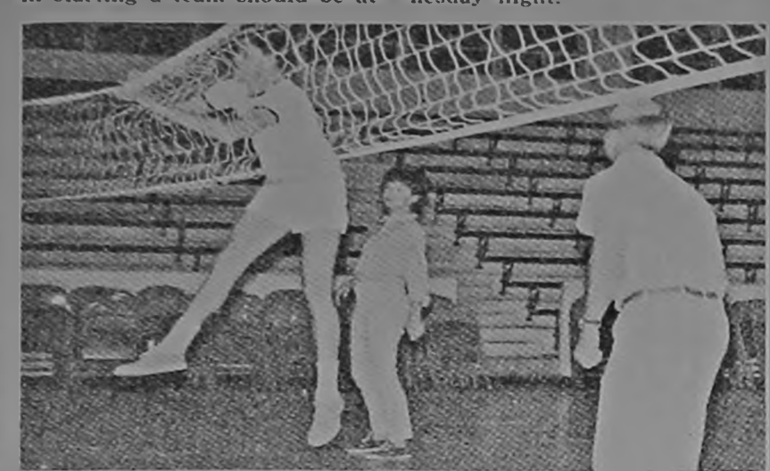
In the first intra-mural volleyball game the Campus Canopy defeated the speech department by winning three games.

next week Anyone interested the organizational meeting Wed in starting a team should be at nesday night.