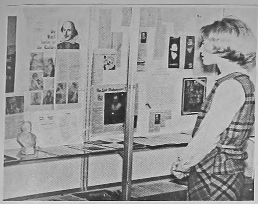
The current library exhibit on Shakespeare will be on display until May 2. Most of the material is from the collection of Alex McFadden of the English department.