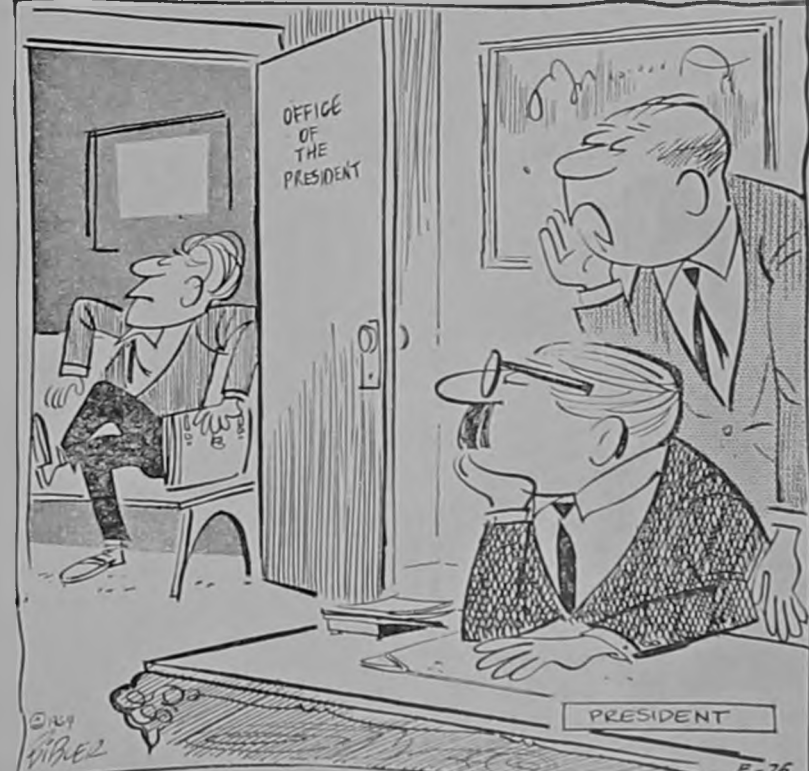
"I'D SAY HE SHOULD MAKE AN EXCELLENT COLLEGE INSTRUCTOR, PREXY, THE FILE ON HIM STATES HE DOESN'T PLAN LECTURES— USES LINDRIHOOD TEACHING METHODS & IS UNABLE TO COMMUNICATE."