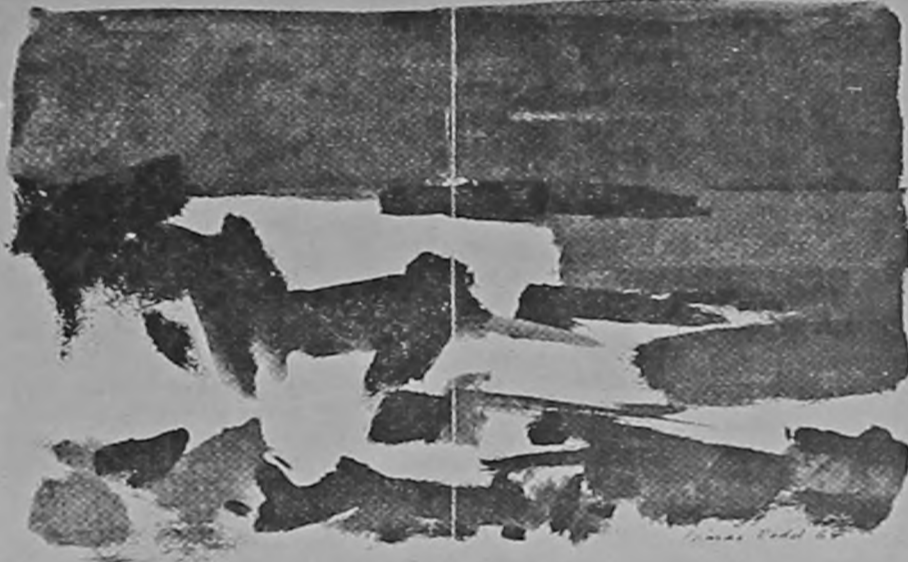
A water color sea scene by Lamar Dodd.

11:00 A.M.—Inauguration ceremony 3:00 P.M.—Science seminar Room 3, Nevins Hall Bus leaves from Ashley at 10:15 and 10:35 for Mathis Auditorium.