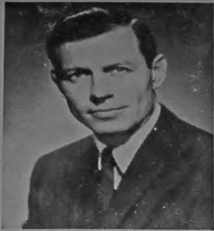
Governor Carl Sanders