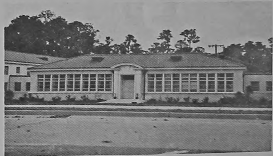
Joseph E. Brown Hall