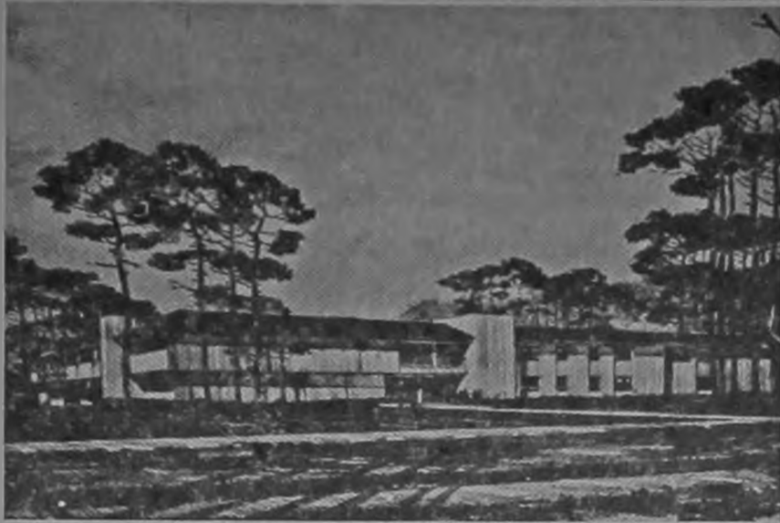
The Architect draws his concept of the planned Fine Arts Building.

Those wishing to contribute to the book drive should contact the College Relations Office.