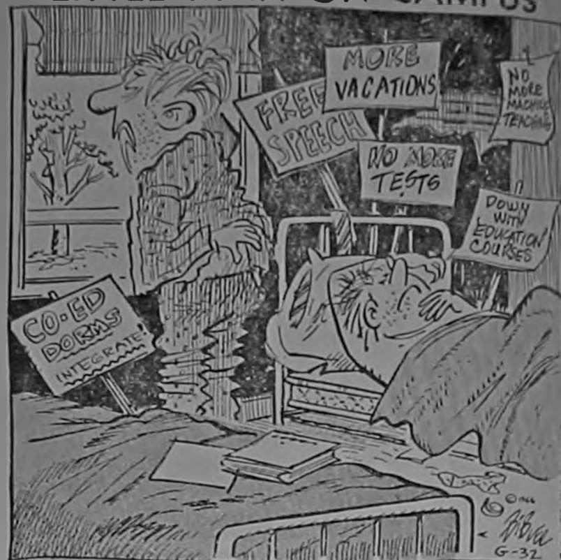
I JUST DON'T FEEL LIKE GOING TO CLASS - LET'S DO SOMETHING WORTH-WHILE LIKE CIRCULATING A PETITION OR PICKETING THE ADMINISTRATION.