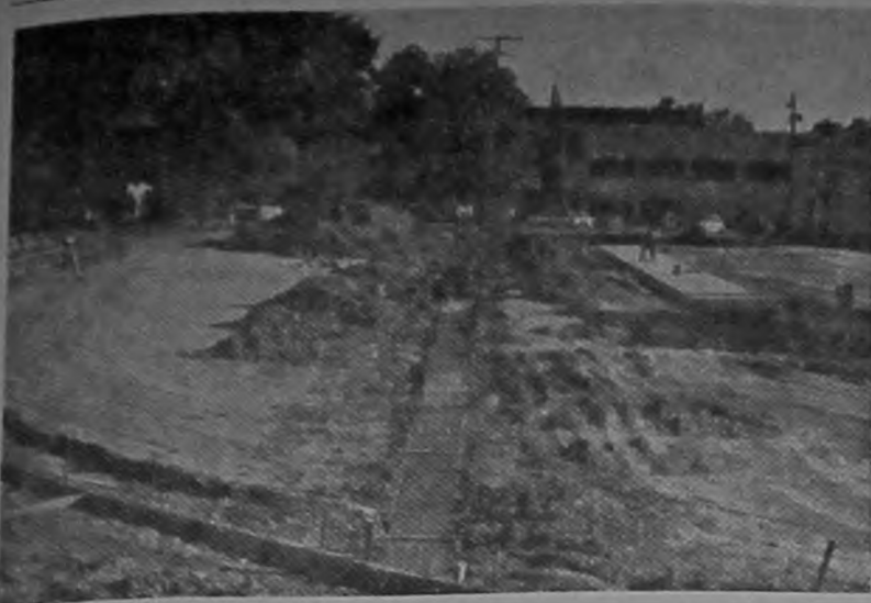
There is much construction going on at VSC. Above is the new parking space at Hopper Hall. Below is the fine arts building.