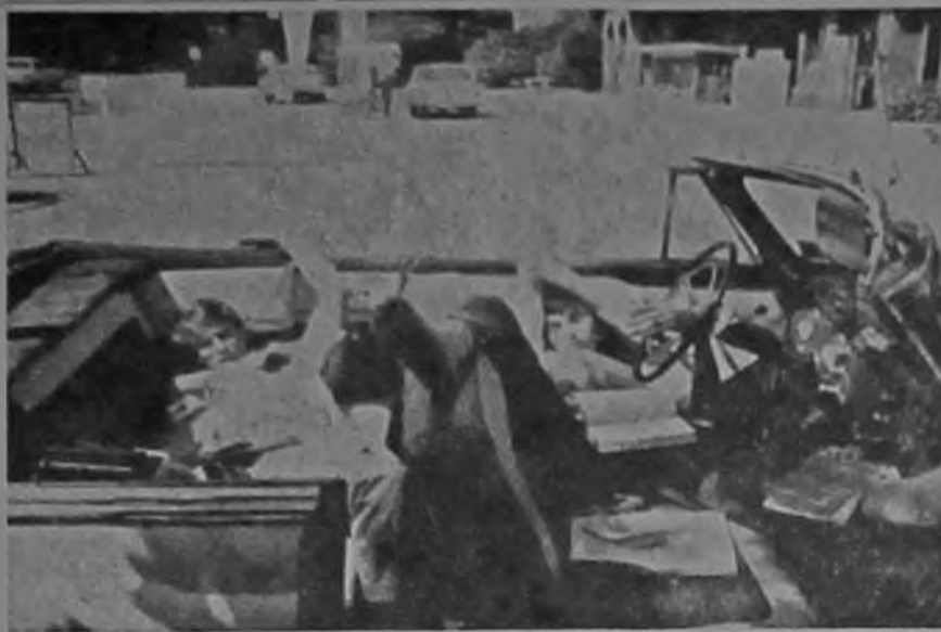
The housing shortage presented quite a problem for these men.