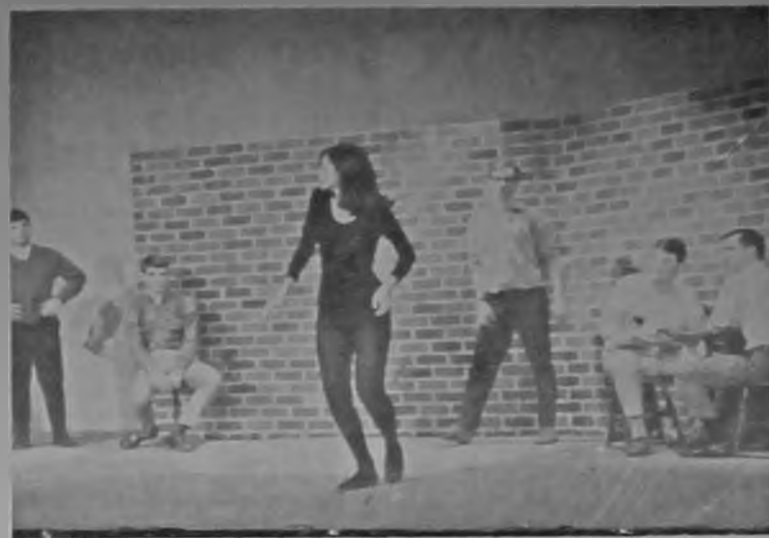
Practicing for "Kiss Me Kate"