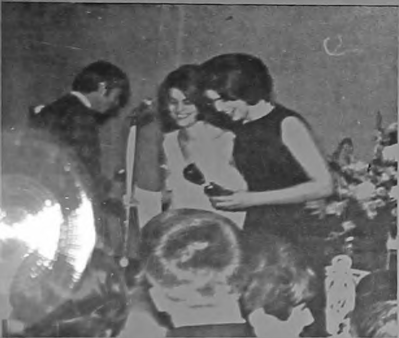
Alpha Xi Delta Win Song Fest