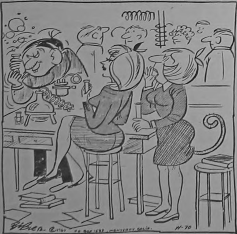
A WORD OF WARNING - DON'T DRINK ANY OF HIS SILLY COCCATIONS.