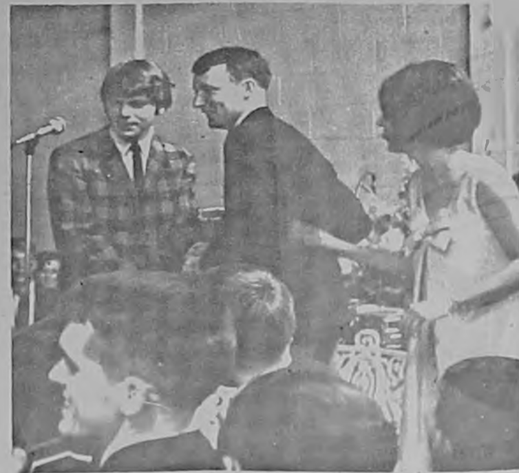
Delta Chi Wins Olympic and Chariot Race

This week, planned and sponsored by Panhellenic Council and Interfraternity Council, was a very enjoyable five days for all Greeks on campus.