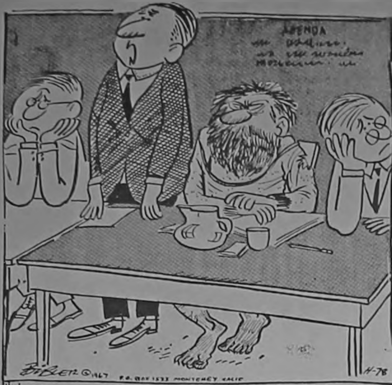
"NOW THE FACULTY SENATE WILL HEAR A WORD FROM THE CHAIRMAN OF THE STUDENTS RIGHTS COMMITTEE."