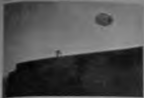
Photograph taken by VSC student showing a bright light source in the sky above a dark structure.

The VSC student group has provided a photograph that proves the existence of a UFO. The photograph, taken on the night of the 15th, shows a bright, circular light source in the sky above a dark structure. The light source is described as being very bright and having a distinct, circular shape. The photograph is considered to be one of the most convincing pieces of evidence for the existence of UFOs.