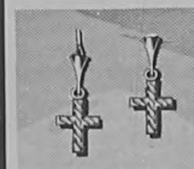
Pierced earrings $5.95