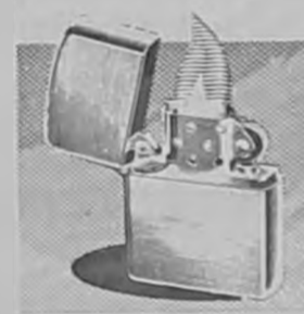
Zippo pocket lighter