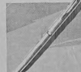
Ball point pen

Welcome V. S. C. Students Charge or Budget Accounts