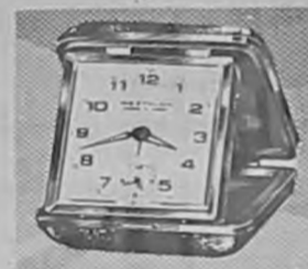
The Westclox "Traveler"