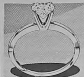
Classic 4 prong setting $129