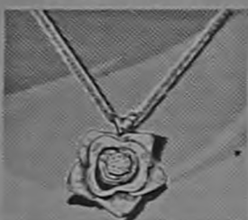
14K gold diamond pendants from $19.95

Any student at VSC is welcome to open a charge or installment account at either of our fine stores BROOKWOOD PLAZA or DOWNTOWN