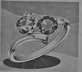
Birth stone rings from $12.95