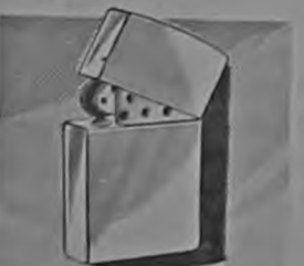
Cigarette lighters from $3.50