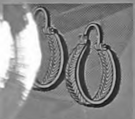
Large selections of 14 K gold earbobs from $3.95