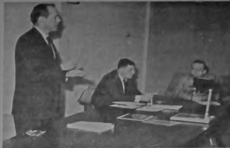
Education Advisory Committee

"But it is exciting and worthwhile," he continued, "in spite of the complications, burdens, and problems."