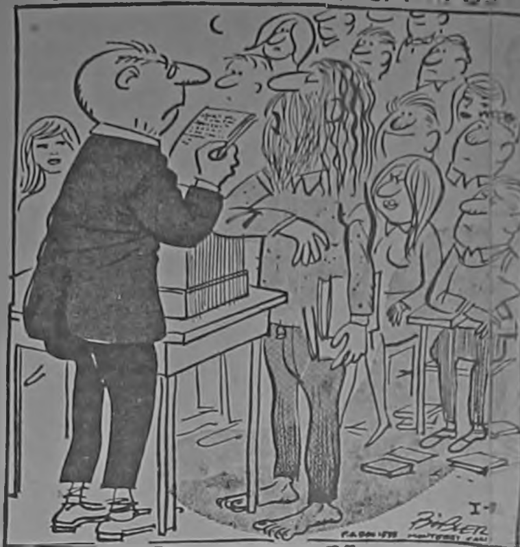
"THE REASON I'M LATE FROM P.E. IS BECAUSE THE HAIR DRIER BROKE DOWN IN THE LOCKER ROOM"