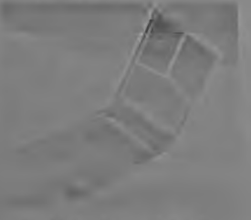
Wallets from $5.00