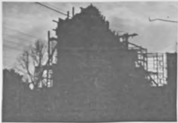
Construction covered illegal operation

"Quality is not guaranteed in the student body system." "We are not being quality." "We could be quality if we had more quality." "We should give no class a class at all." "We should give no class a class at all."