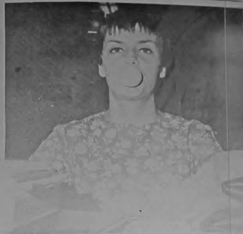
Library proves conducive to good study habits

"My reference room, my tables and table, cloths, chairs, my desk, my wooden shoes, and a leg off my easy chair are now all gone," she sobbed.