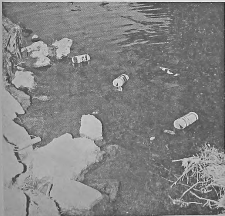
Debris decorates stream

Last year Governor Maddox visited VSC to dedicate the bridge over the unnamed creek. "We feel that through giving distinctive names to natural beauty spots on campus, such as was done with the Chameleon Trill," said Miss Wishful Thinking of the VSC Improvement Committee, "we can arouse more interest in the college."