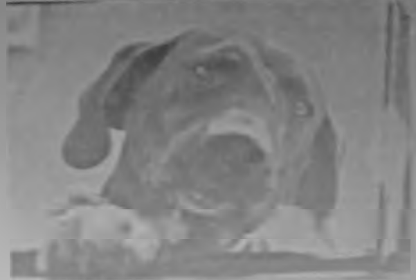
"Do you mean 'Housebreaking 204' is already closed out?"

Perhaps this is because of this unique growth pattern, or something, that they are always larger at the end where the action is (or is supposed to be.) Now, let me tell you the one truth that keeps us all from giving up. "They also serve who only stand and wait." (Tell that to the discouraged and down-trodden.)