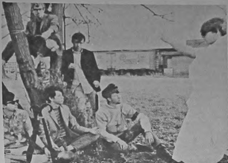
SDS students rally to their leader

Weather forecast: "Rainy and cold again today, with possible clearing in late April."