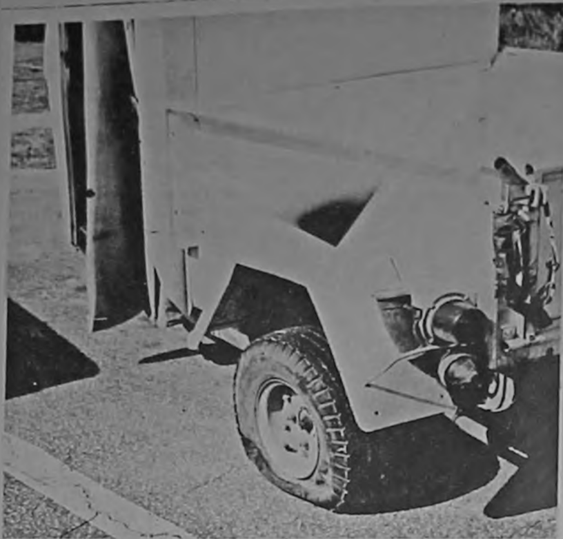
Wreck involves 6 security vehicles

No injuries were reported, but the patrol cars suffered slight damage and the VW got away.