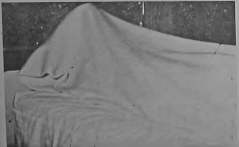
Infirmary patient doesn't revive