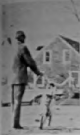
College Relations Director solves Parking Problem