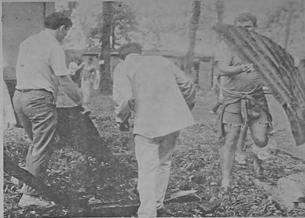
Campus organizations participate in Clean-Up