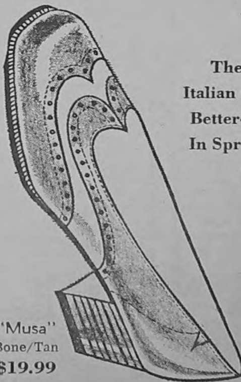
"Musa" Bone/Tan $19.99

The Magic Of Italian Craftsmanship Better-Soft Leathers In Spring's Prettiest Color's