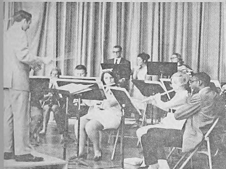
VSC band performs