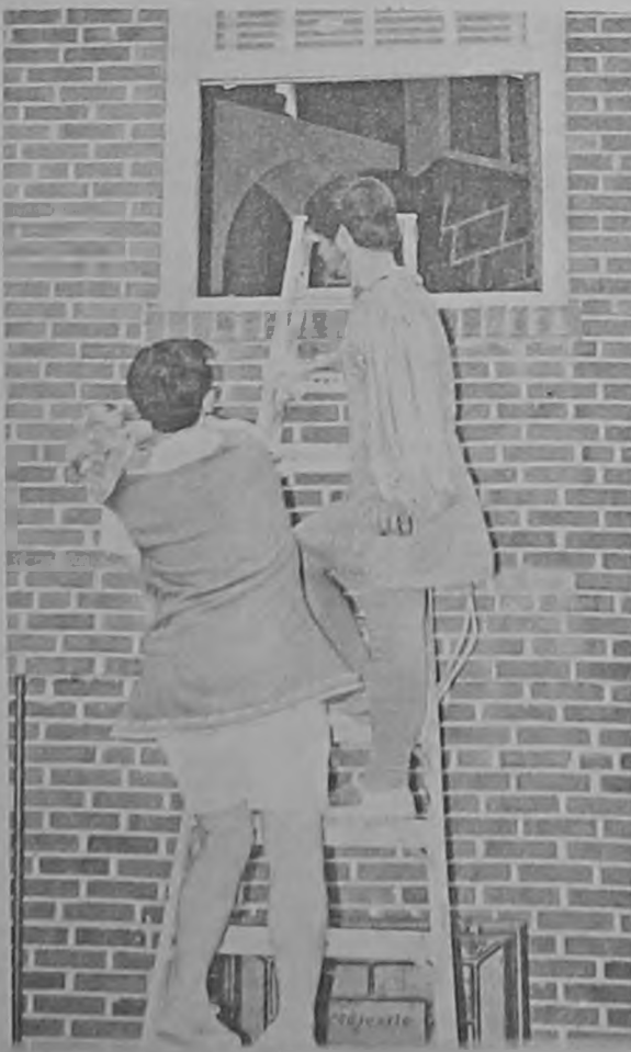
Enter stage right