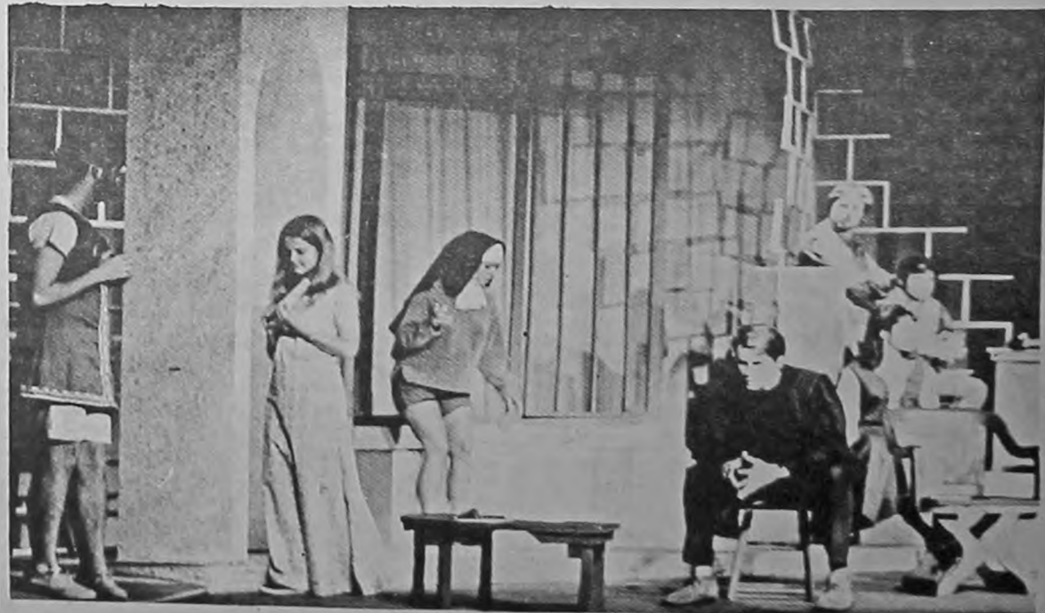
Cast rehearses play