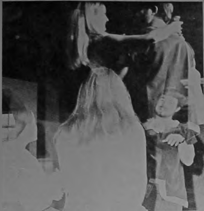
Looks are deceiving