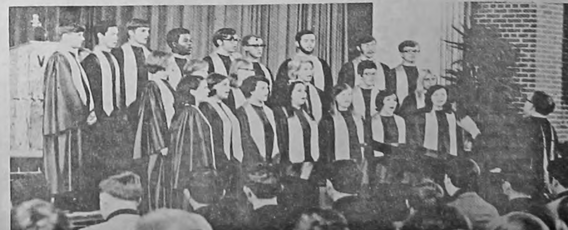
Glee club performs