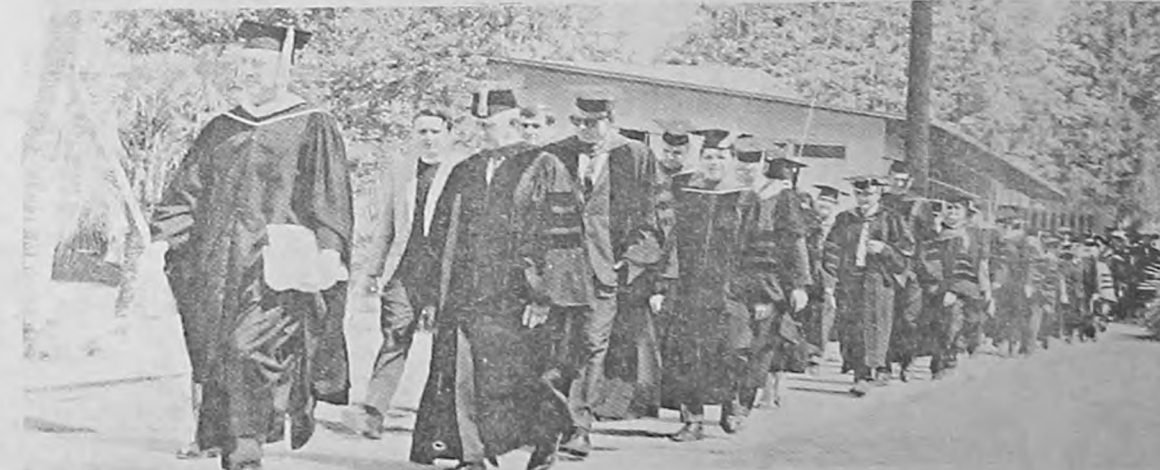
Professors form ranks