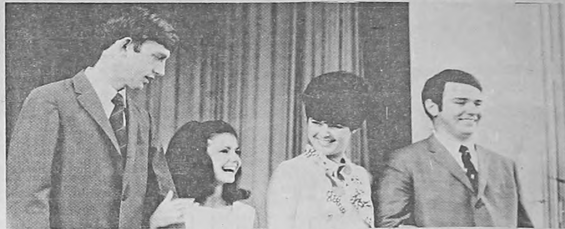
Margas and Macs