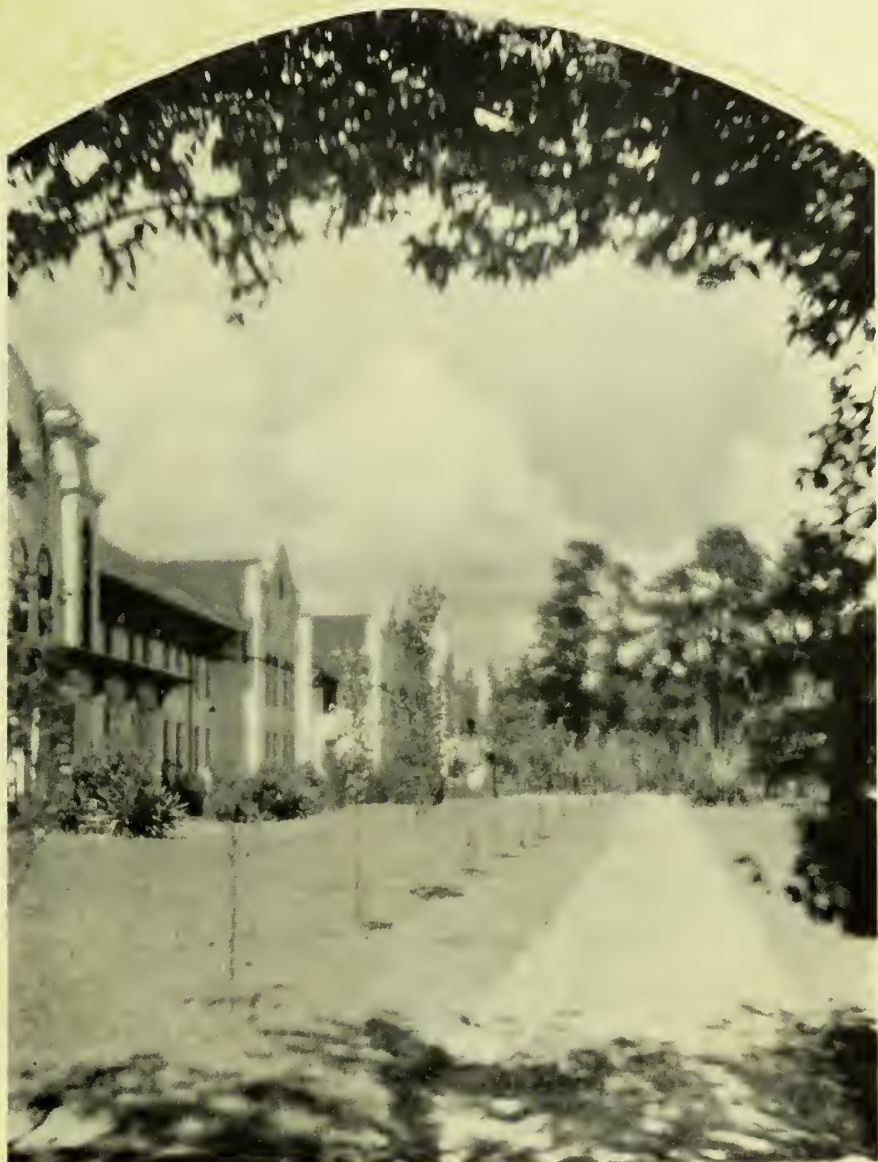
The Prom Path