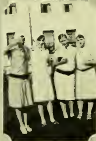
FRESHMAN LUNCH TIME