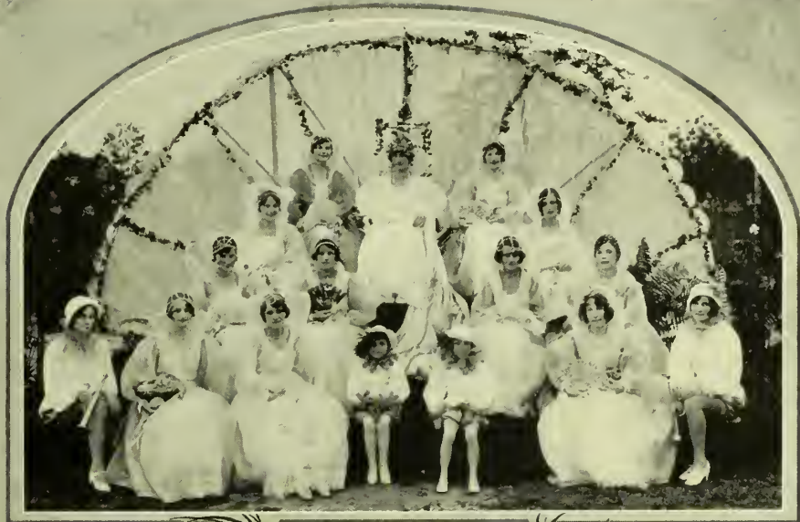
The Queen & her Court