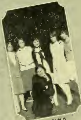
A GOOD BUNCH