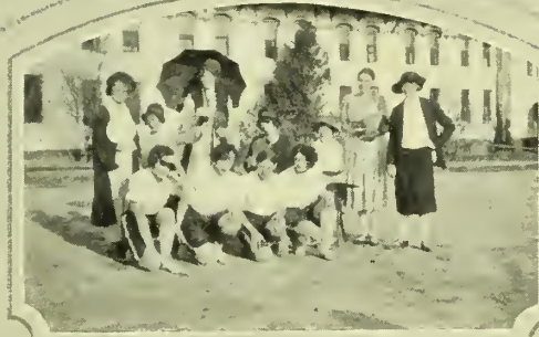
Past vs. Present