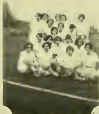
PHI LAMBDA SOCCER and VOLLEYBALL TEAMS