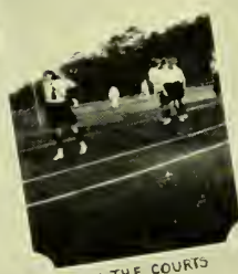
ON THE COURTS