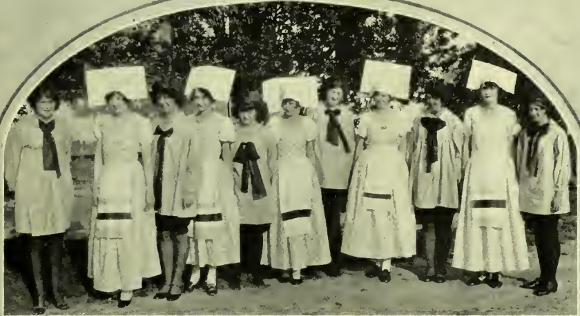
French Peasants The Village Bear