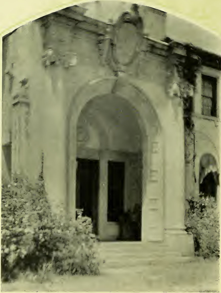
Entrance to West Hall