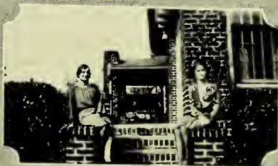
ON A VISIT