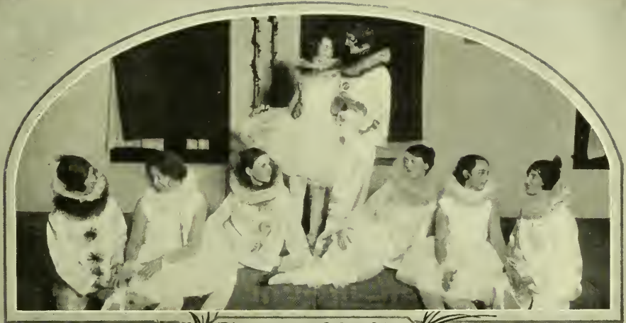
Pierrot and Columbine