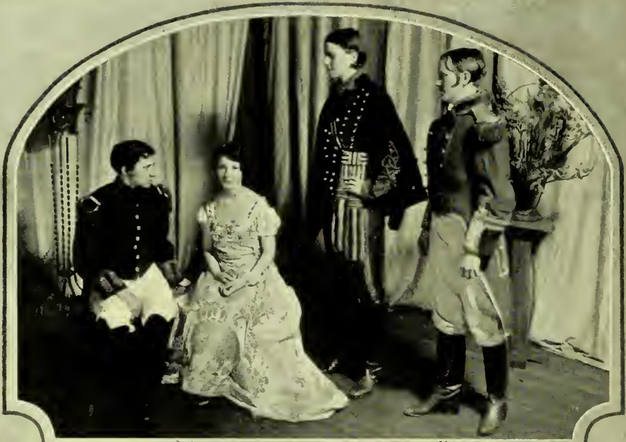
Sophomore Class Play