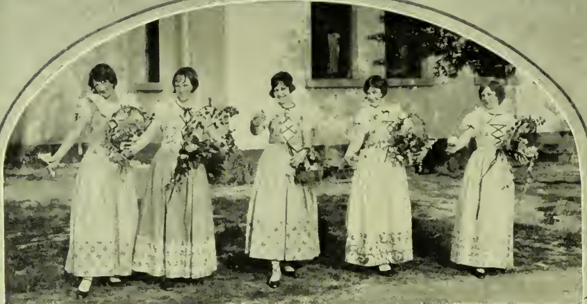
Flower Maidens The Queen