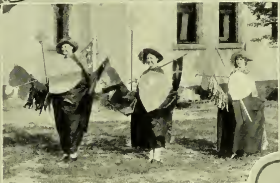
English Hobby Horses Village Folk