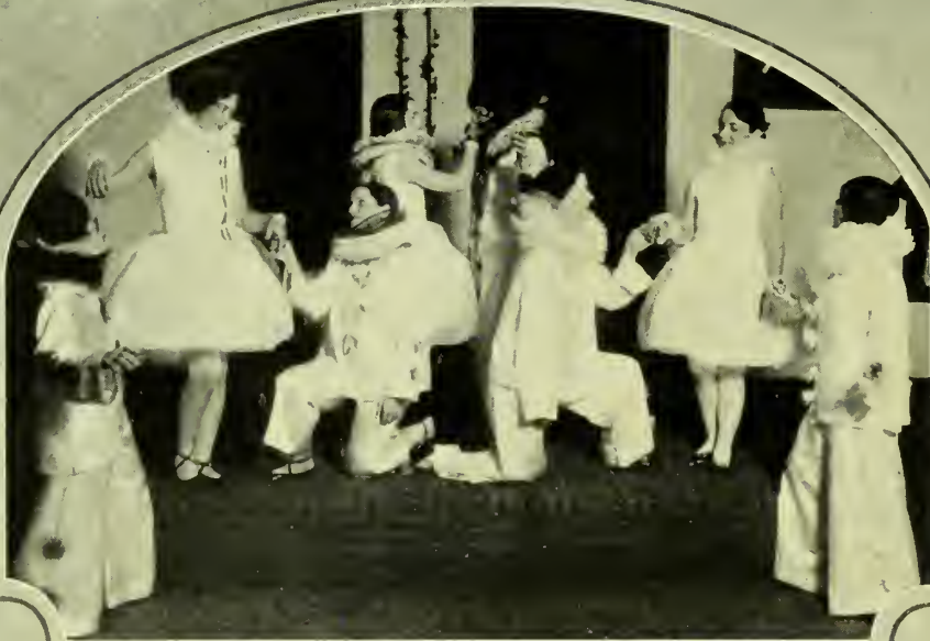
Pierrot and Columbine Wooden Soldiers