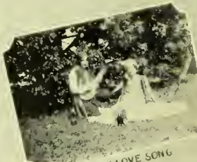
GYPSY LOVE SONG