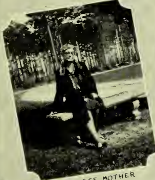
OUR COLLEGE MOTHER