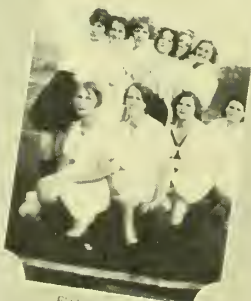
PHI LAMBDA BASKETBALL TEAM