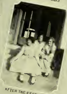
AFTER THE FESTIVAL