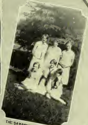
THE JAVANNAH INSEPERABLES