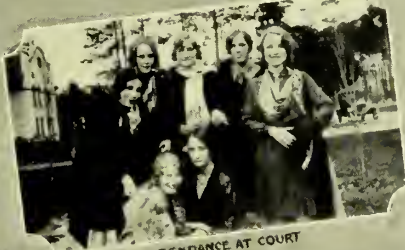
ATTENDANCE AT COURT