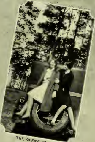
THE OFFICE POWER