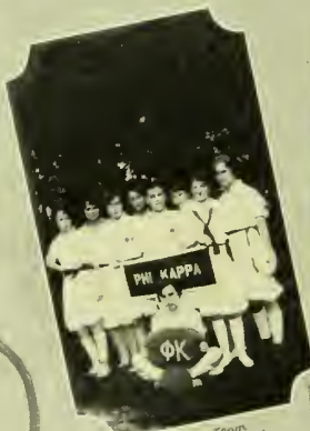
First Team VOLLEYBALL