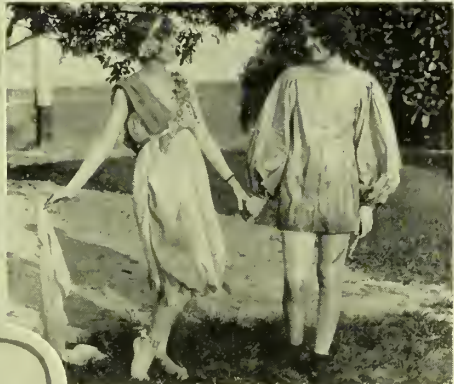
Nymph and Shepherd Lords and Ladies