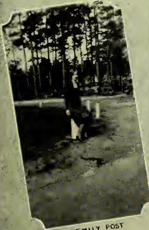
OUR EMILY POST