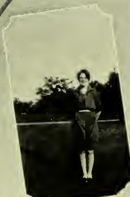
A REGULAR HIKER