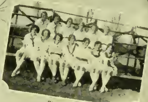
PHI KAPPA SOCCER SQUAD