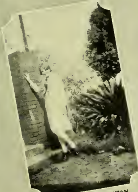
THE LEADING FRESHMAN