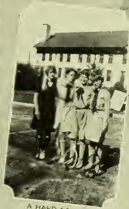
A HARD GAME