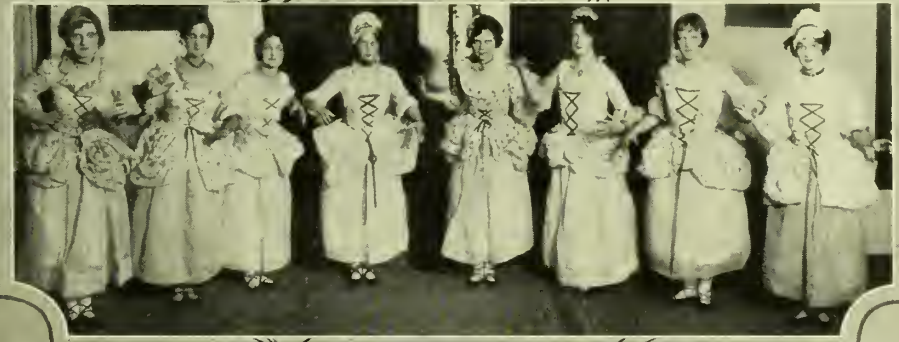
Dresden Dolls Minuet