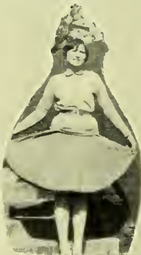
U. NELSON Most Cheerful