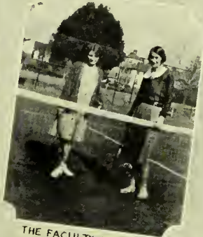
THE FACULTY ATHLETES