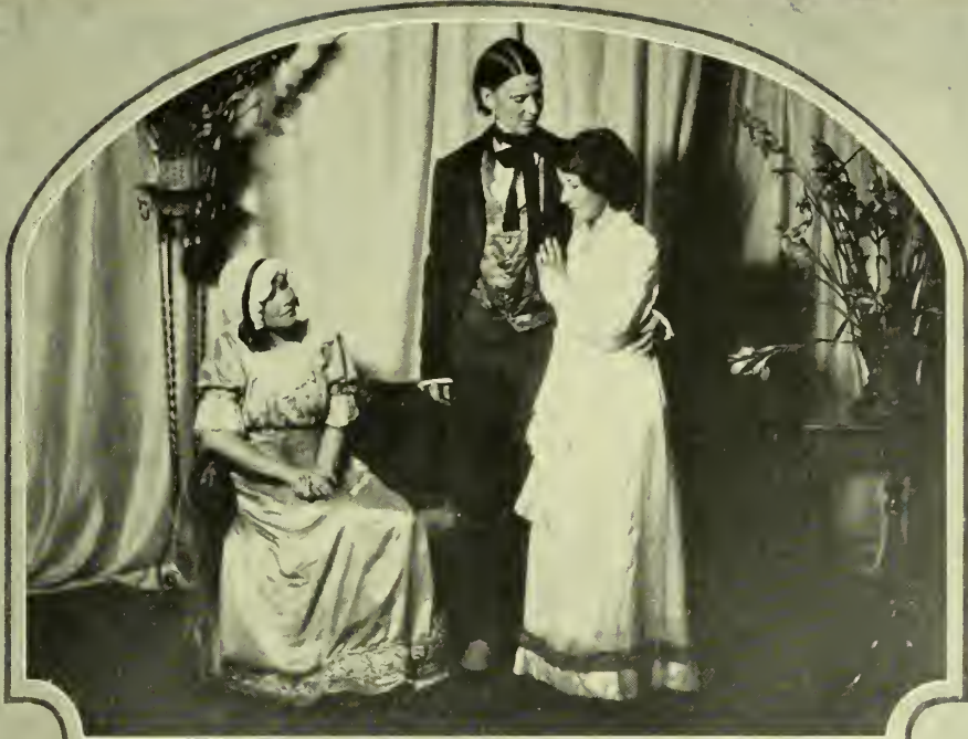
Sophomore Class Play