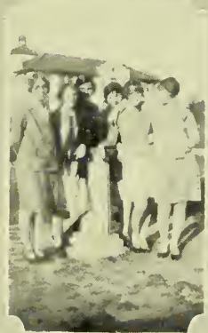
ATTRACTED BY THE SUN