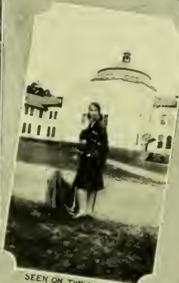
SEEN ON THE CAMPUS