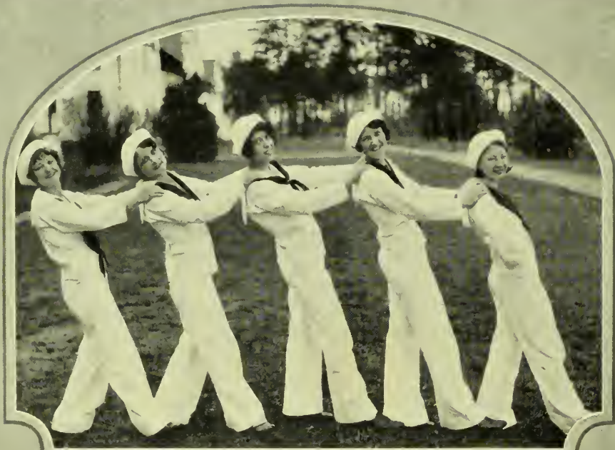
The Glee Club