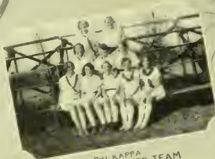
PHI KAPPA VARSITY SOCCER TEAM