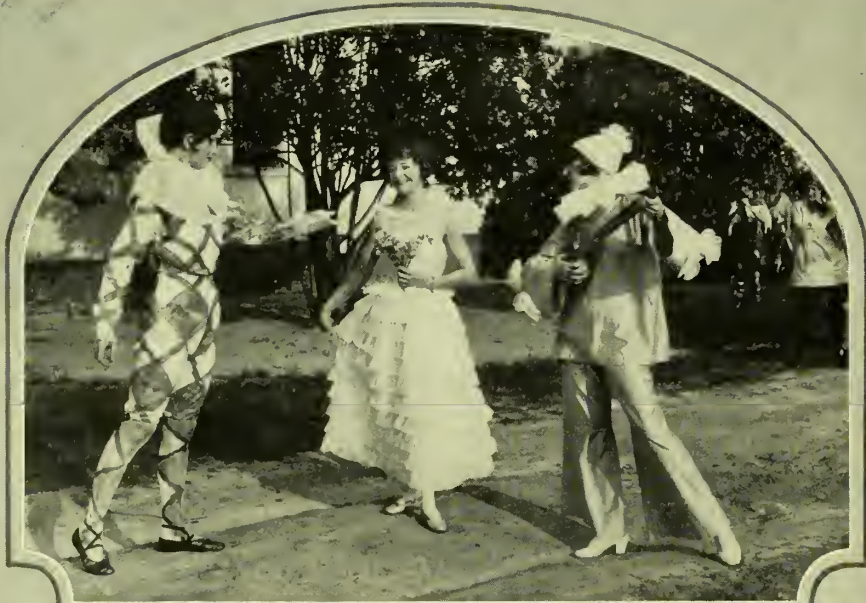
Harlequin-Columbine-Pierrot The Pirate Band