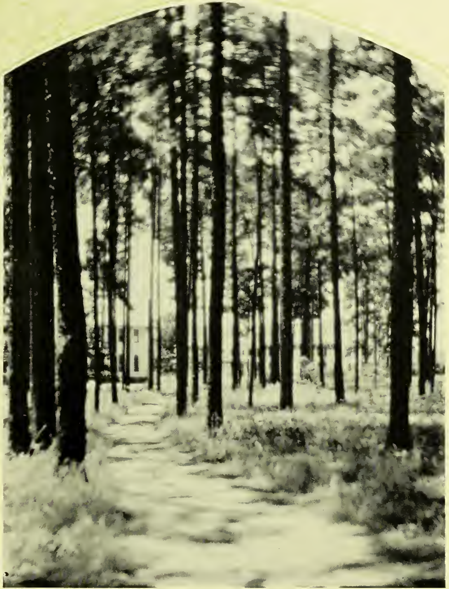
The Path in the Pines