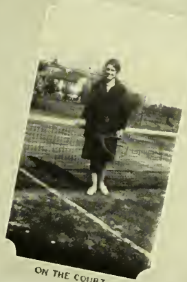
ON THE COURT