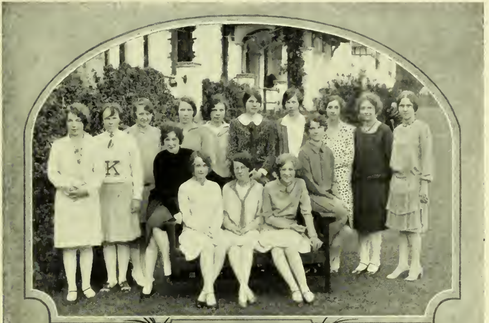
President's Club Class Day