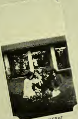
THE TELLING FEAT