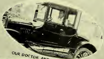
OUR DOCTOR AND HIS CAR