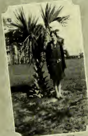
PART OF THE SCENE