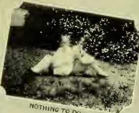
NOTHING TO DO