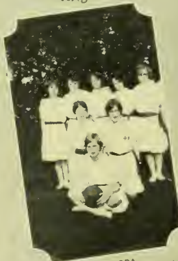
PHI LAMBDA 2 ND VOLLEYBALL TEAM