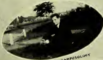
OUR PROFESSOR OF CAMPUSOLOGY