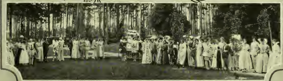
May Day Processional Heralds & Ladies-in-Waiting