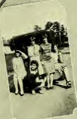
READY TO RIDE