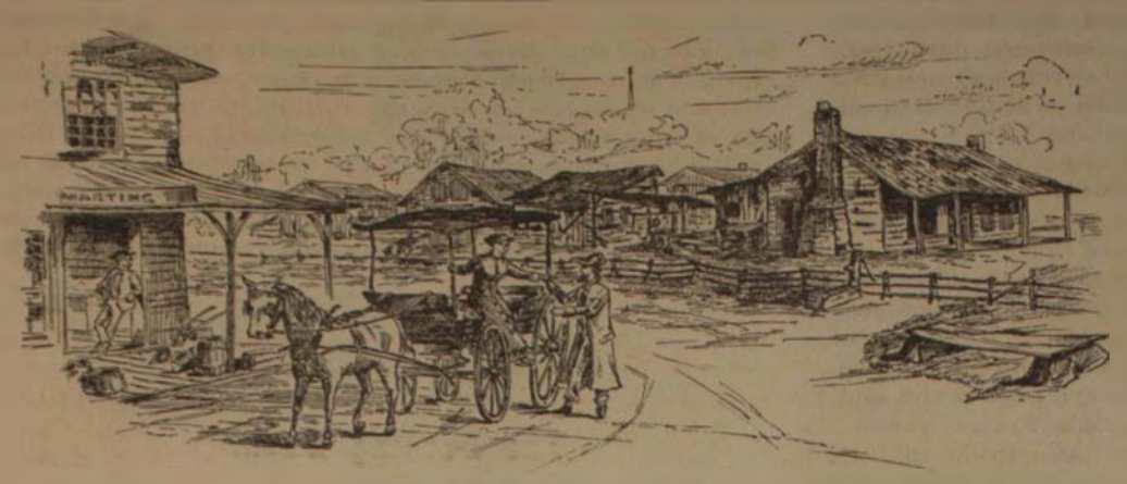
"THIS IS YOUR HUDDLE, THIS 'ERE."