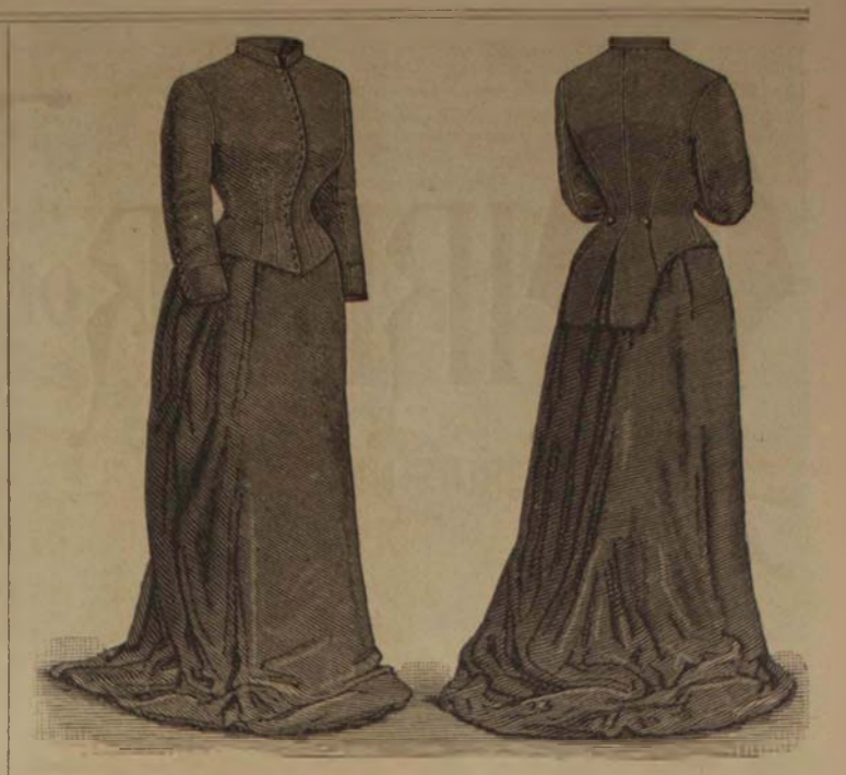
down the front, finish the basque stylishly without any other trimming. Patterns in two sizes, medium and large. Price, thirty cents each.

Palisade Riding Habit.—This stylish and graceful habit consists of three parts—a tight-fitting postilion basque, with the usual number of darts in front, short side gores under the arms, with a cross seam at the waist line where a short basque skirt is added, side forms rounding to the armholes, and a seam down the middle of the back; a skirt cut with a genouillère, or knee gore, at the right side, rounding to allow the skirt to fall evenly when the right knee is placed over the pommel of the side-saddle; and plain riding pants. This design is suitable for ladies' cloth, serge, camel's hair, cashmere, velvet, and dark flannels. Bindings of silk galloon, in tailor style, and small buttons set closely together