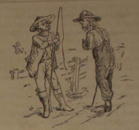
OUR OLDEST INHABITANT

Much has been said and sung of the tranquillity and simplicity of a life "far from the busy world's ignoble strife," but we doubt whether the authors of these effusions speak from experience, having tried life in a huddle. Lavish nature showers her gifts even in this remote corner of the world. We have our full share of spring tenderness, of summer