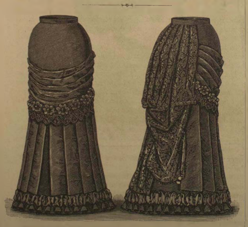
FavoritaWalking Skirt.—A novel and graceful style of walking skirt, composed of a gored skirt short enough to escape the ground all around, and trimmed on the bottom with a chicorée ruche and knife-plaiting, over which is arranged a

Fig. 3.—This charming street costume of noisette cashmere and striped plush in gold color and brown, is composed of a tight-fitting, double-breasted basque, and short skirt with a full drapery of cashmere, and a deep flounce of plush kilt-plaited at the back and plain in front. A narrow knife-plaiting trims the underskirt around the lower edge, the drapery is looped at the side with brown plush bows, and the revers and collar on the basque are of brown plush. The vest and under basque skirt are of plush, and the basque of cashmere. The design illustrated is the "Isotta" costume. English walking hat of brown English straw, faced with brown moleskin plush, and trimmed with brown plush bows, a gilt slide, and shaded brown and gold ostrich plume drooping from the left side of the brim. The double illustration of the costume will be found among the separate fashions. Price of patterns, thirty cents each size.