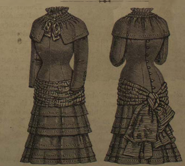
Marcelle Costume.—This simple and easily arranged costume is composed of a tight-fitting princess or Gabrielle dress,

Barbette Skirt.—This stylish model is composed of a gored underskirt, trimmed all around the bottom with a deep box-plaited flounce, and an overskirt having a draped apron trimmed with a narrow box-plaiting, and a bouffant back drapery falling in two square tabs. The design is suitable for any class of dress goods, and may be trimmed as illustrated, with bands of contrasting material, or rows of braid, according to taste and the material employed. The front view of this is shown elsewhere in combination with the "Frances" basque. Patterns in sizes for from twelve to sixteen years. Price, twenty-five cents each.