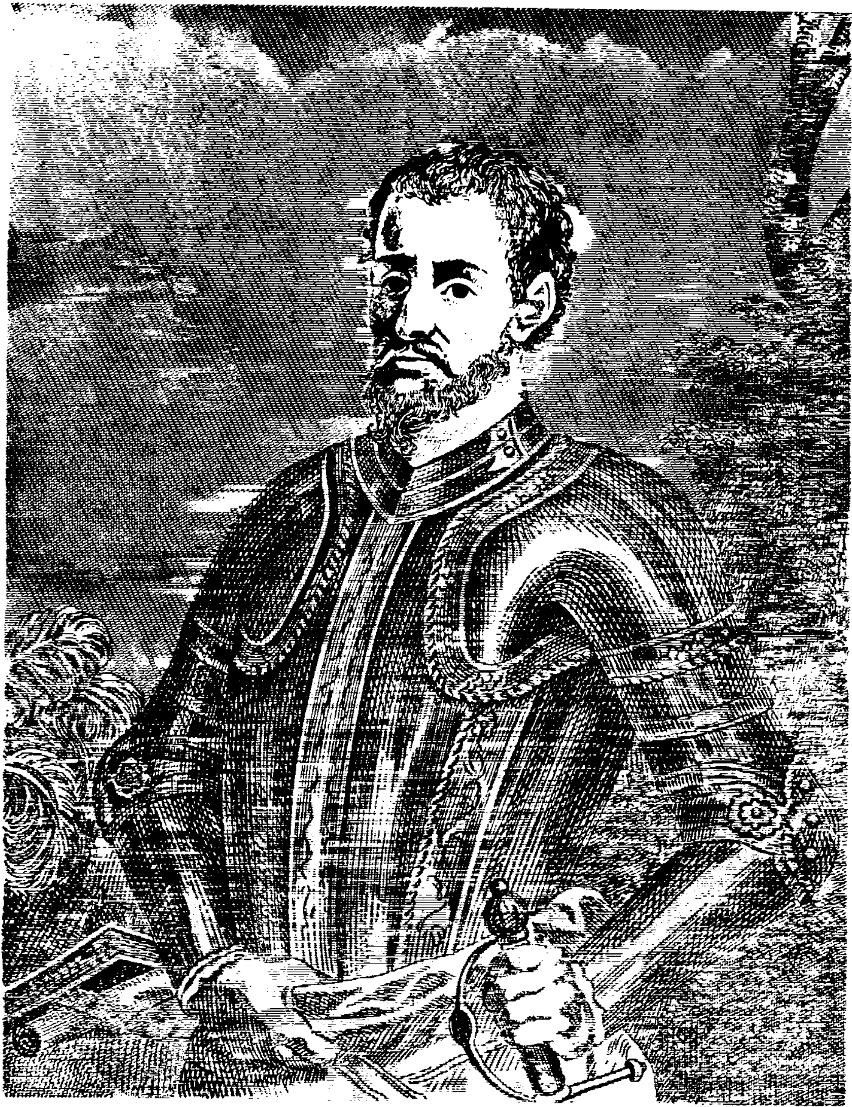
HERNANDO DE SOTO.

Engraved for the Bradford Club New York 1865