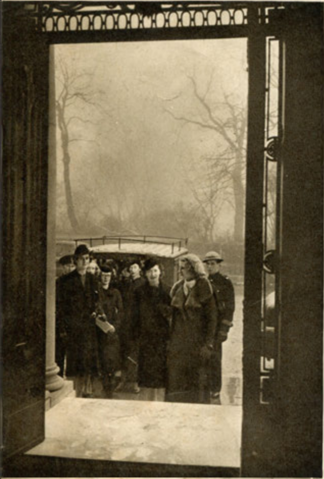
Arriving for work: some of the staff live at Headley Park, near Epsom, where the whole Embassy might go if London were bombed. They commute daily between Headley Park and Grosvenor Square by Embassy bus. A skeleton staff is always on duty at Epsom