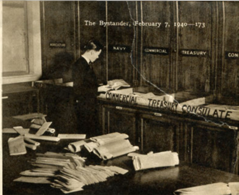
Mail in: the mail-room clerk sorts the morning delivery, which includes a half-pint bottle of milk for the Treasury