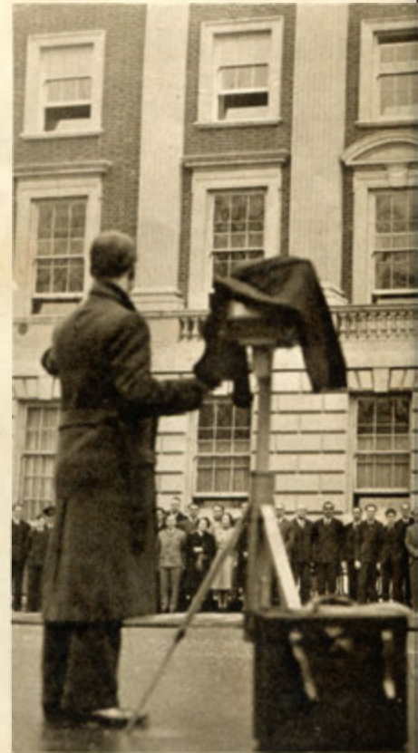
The whole staff, including the Ambassador himself (on the steps) was grouped in front of the Embassy for a presentation picture for Mr. Kennedy before he left for his Christmas visit to America. The Embassy and Consulate-General occupy three floors of the large modern neo-Georgian No. 1, Grosvenor Square, on the corner of Grosvenor Street. Above the Embassy are private flats