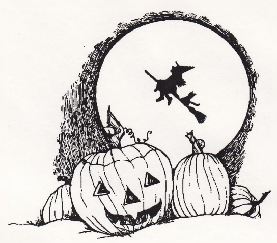
31 October 2001 ce Hallows Eve "The Hallows Ritual of Lothloriën" or The Hallows Journey of Lothloriën

20 October 2002 ce Full Blessed Thistle Moon actual: 3:20 am EDT - 27° Aries 43' Monday the 21st The Ritual of Lothloriën